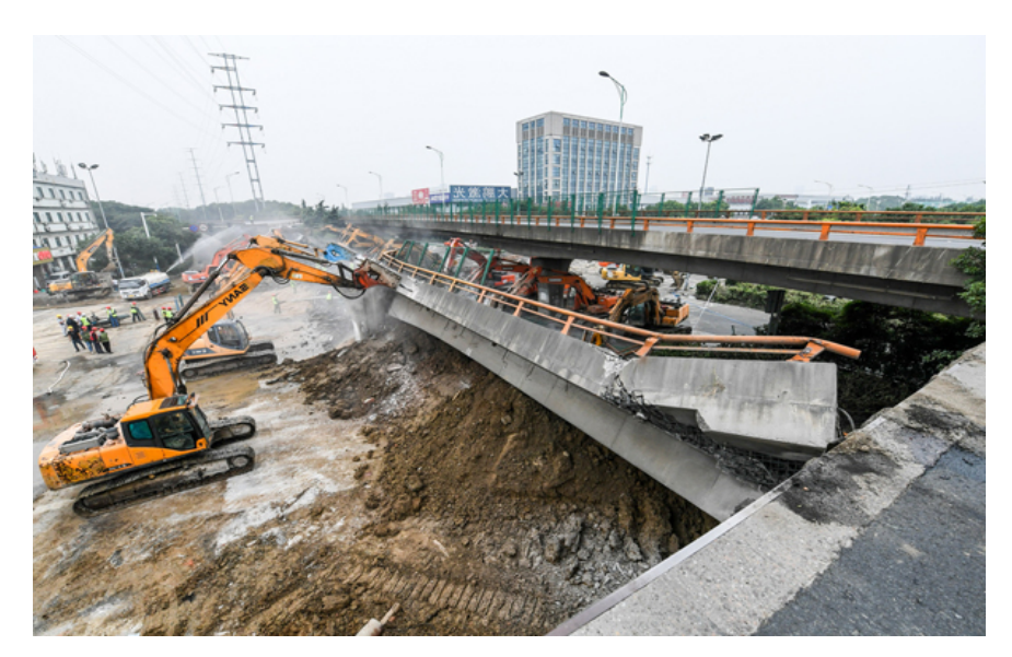
Figure 1. The scene of the accident.

Caixin Global, one of China's famous financial magazines reported the event in detail (see Figure 2 ): "[M]any large vehicles were presented on the bridge at the time, one of which was a truck carrying six large coils of steel"<sup>2</sup>.