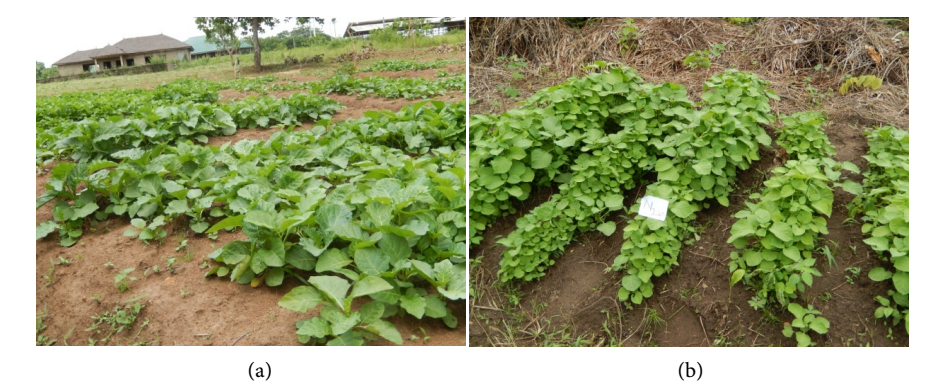
Plate 1. Photo of (a) Solanum macrocarpon and (b) Solanum scabrum at the experimental station.

The result showed a significant (p < 0.05) increase in dry matter yield only at 160