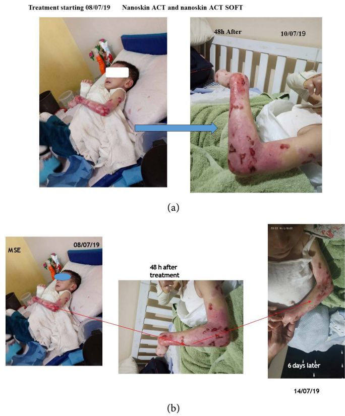
Figure 3. (a) Applying Nanoskin ACT, Nanoskin ACT soft for Eb treatment; (b) The evolution of Eb treatment by Nanoskin ACT, Nanoskin ACT soft.