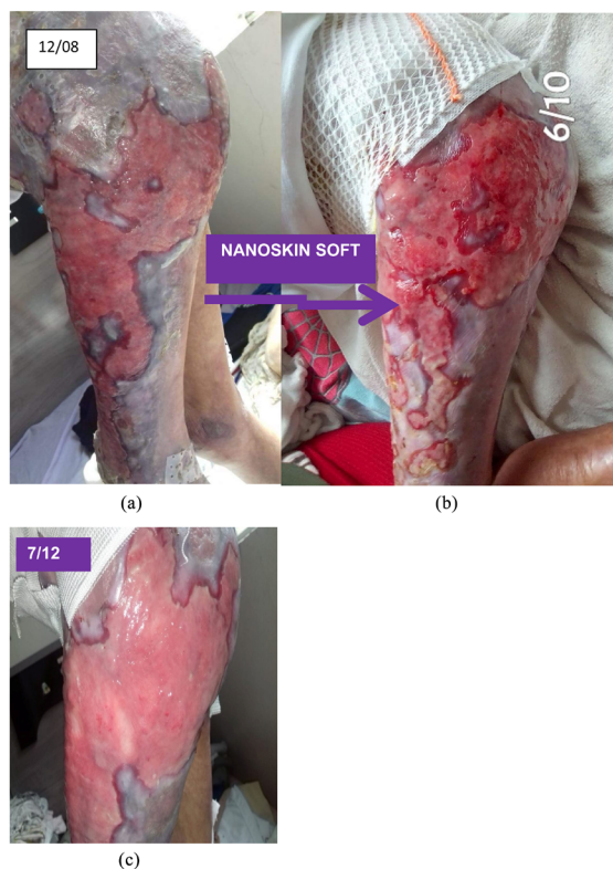
Figure 2. The evolution of Eb treatment by Nanoskin ACT, and Nanoskin ACT soft. (a) before treatment, (b) after 2 months treatment intense red color, (c) after 4 months with new skin regeneration.

Child one year old with Stevens-Johnson syndrome, Figure 4 shows the baby before treatment (a). (b) after applying Nanoskin ACT and Nanoskin ACT SOFT, treatment has been started with interval time changing every 48h and Nanoskin ACT SOFT, (c) complete healing.