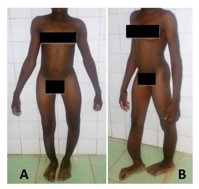
Figure 1. (A) and (B) showing bone deformities and lengthening of left upper limb that reaches knee level, shortening of right upper limb, curved aspect of right leg.