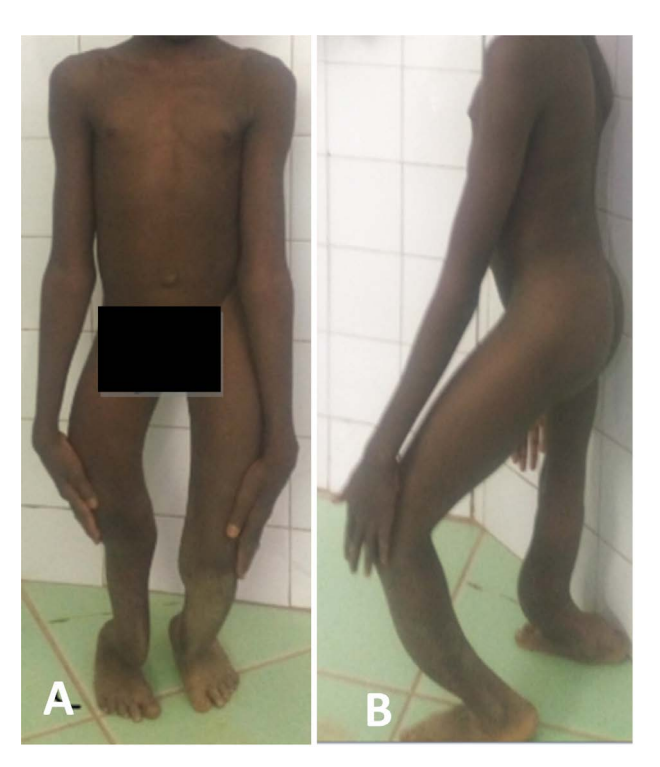
Figure 3. Photo (A) and (B) respectively frontal and lateral view showing deformation of lower limbs occurring on femurs, legs and feet. Shortening of lower limbs compared to upper limbs that reach knee level.

Z. A. was 5 years old, she weighed 11 kg for a height of 93 cm. She is the youngest of the family. She was born after an 8-year-old boy, who weighed 19 kg for 117