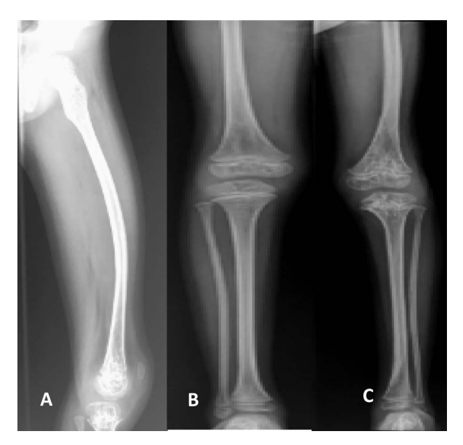
Figure 6. A frontal and lateral view of left thigh plain film and (B), (C): frontal view of both legs plain film showing curvature of femoral diaphysis and prominent bone demineralization with flared metaphysis. Tiny aspect of tibial and femoral diaphysis contrasting with a flared appearance of lower femoral and upper tibial metaphysis producing "trumpet" aspect; Popcorn calcification: scalloped radiolucent areas with sclerotic margins sitting in lower femoral metaphysis, predominant on the left side sometimes on epiphysis.