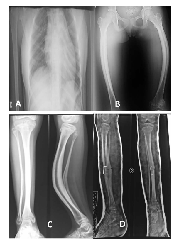
Figure 2. (A) Chest plain film, frontal view: tiny aspect of left posterior ribs; (B) Femurs X-ray frontal view: shortening of the left thigh with curved aspect of the ipsilateral femur and metaphyseal demineralization; (C) Right leg X-ray frontal and lateral views: tiny and curved aspect of both tibia and fibula diaphysis (plastic deformation). Cortical thinning at metaphysis and epiphysis levels; (D) Post-surgery: osteotomy with clip on right tibia under plaster.

Figure 1. (A) and (B) showing bone deformities and lengthening of left upper limb that reaches knee level, shortening of right upper limb, curved aspect of right leg.