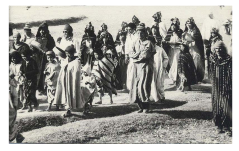
Ahidous in 1914