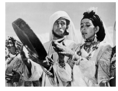
Ahidous in 1950