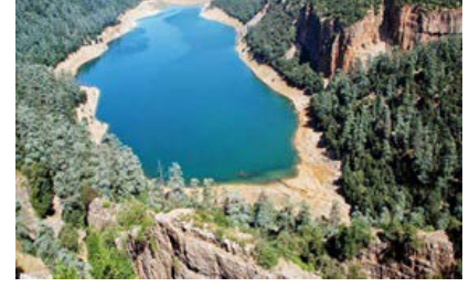
Aguelmame Azegza Lake<sup>15</sup>