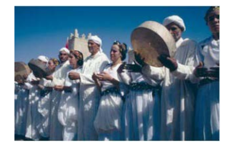
Ahidous in 2019<sup>11</sup>