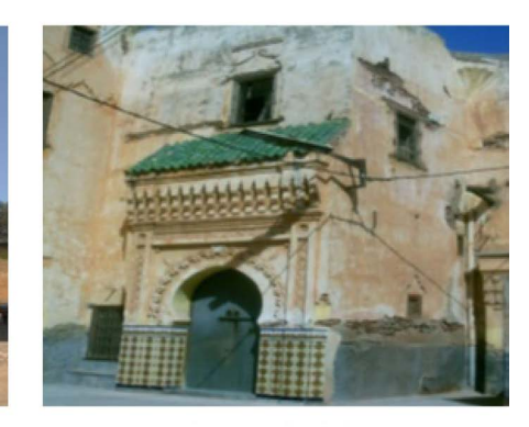
The rest from the Kasbah of Mouha Ouhamou Zayani