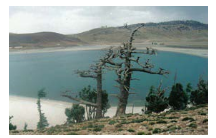
Aguelmame Sidi Ali<sup>14</sup>