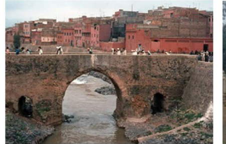
The Portuguese Bridge