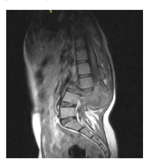
Figure 3. Sagittal sequence in T1 with an almost complete collapse of the L3 vertebra with invasion of the soft tissues in hypo-signal T1.

On MRI, it is objectified an almost complete collapse of the L3 vertebra with a multi-loculated anterior residual part (Figure 3 & Figure 4). The contents of this vertebrae protrude posteriorly occupying the central lumbar canal and the pediculo-lamar space. This heterogeneous formation is in hypo-signal T1 (Figure 3), hyper-signal partly T2 (Figure 4) and is partially enhanced on the injected series (Figure 5). Histologically, the section designs examined under a healthy epidermis show a clearly benign tumor proliferation made of anastomosed vascular sales with regular papillary projections bordered by cells without cytonuclear atypia of malignancy noted. Mitosis is very low, estimated at 1 in 10 fields at high magnification. There are no foci of necrosis on the tumor surface. This aspect suggested a hemangioma. The patient received preoperative embolization supplemented by vertebroplasty. The post-therapeutic evolution has been marked by a progressive improvement in neurological symptomatology. The patient is followed on an outpatient basis per month, without however resuming studies.