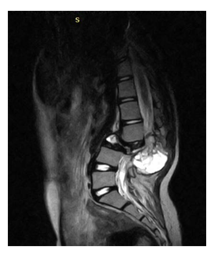
Figure 4. T2 sagittal sequence, objectivizing the almost complete collapse of the L3 vertebra with a residual anterior part and the invasion of the soft parts in hyper-signal T2.