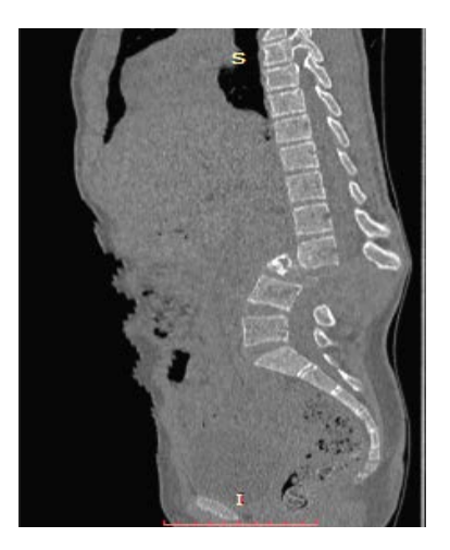
Figure 1. Sagittal reconstruction CT of the lumbar spine which shows a destruction of L3 with retro-listhesis of L2 sue L3.

A 13-year-old patient with no particular history, received in our department for a radiological check-up. The clinical examination revealed non-febrile lumbar pain, an insidiously installed motor deficit of the lower limbs that has gradually worsened over the past 6 months. The patient was investigated by CT followed by lumbar MRI. At the CT, we noted a destruction of the vertebral body and posterior arch of L3 associated with a backward shift from L2 to L3 (Figure 1). These lesions are associated with significant invasion of the peri-vertebral soft tissue and dural sheath with heterogeneous enhancement after injection of the iodized contrast agent (Figure 2).