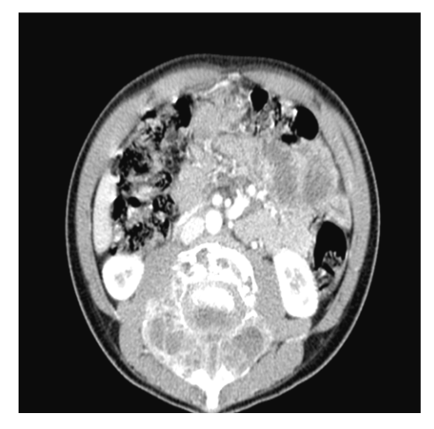
Figure 2. TDM axial section with PCI injection, showing flooding of the vertebral peri-peri soft tissue that rises heterogeneously after PC injection.