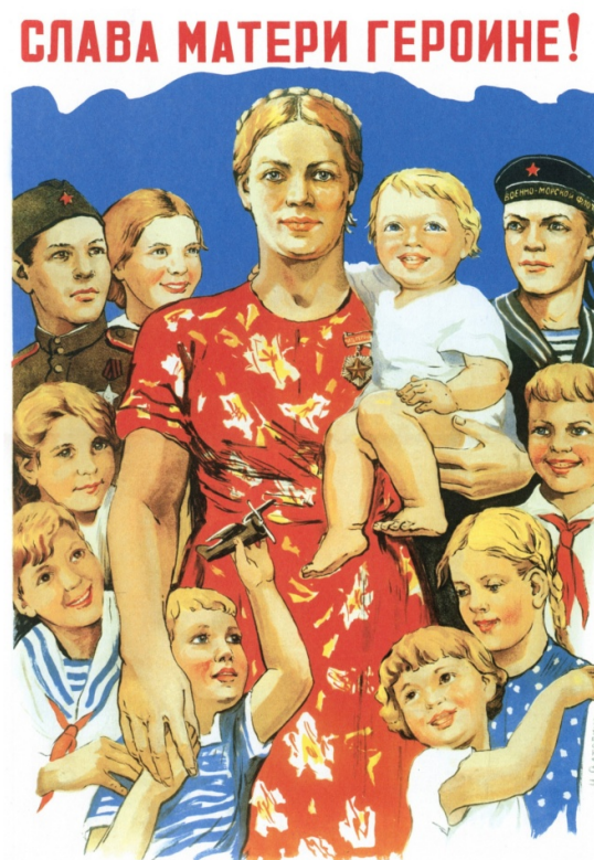
Figure 2. Mother heroine.