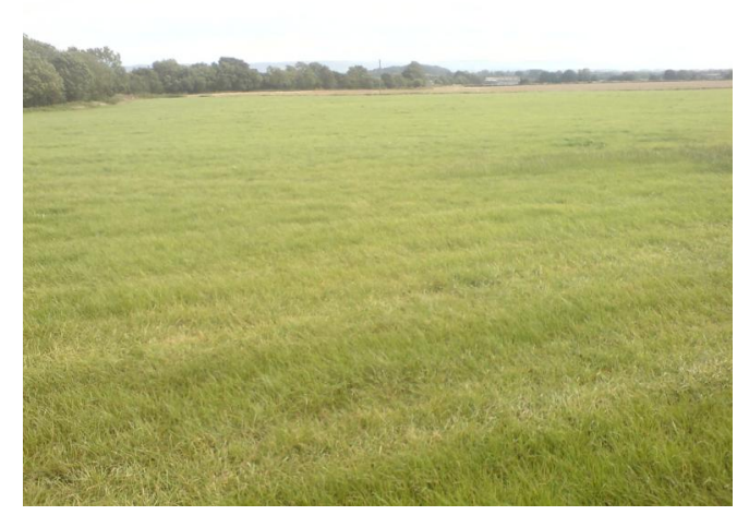
Plate A3. Fennington Farm Grassland (July 2009).