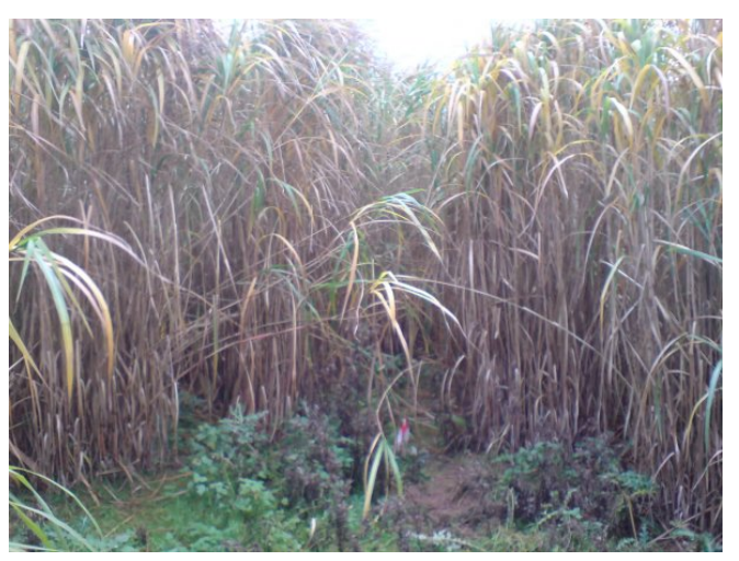
Plate A1. Fennington Farm Miscanthus (December 2008).