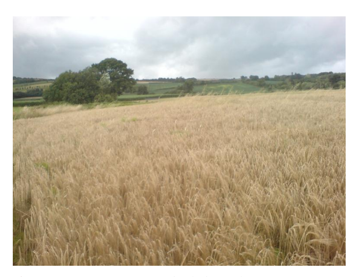
Plate A2. Fennington Farm Barley (July 2009).