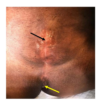
Figure 1. Clinical photograph of complete excised external genitalia with midline scar (black arrow). The small open site (yellow arrow).

She had an elective defibulation, which consisted of splitting the fused remains of the vulva with part of labia minora was seen in the midline superiorly, till the anatomical site of the clitoris was exposed and freed from the tethering fibrous tissue. The cut edges of the tough fibrous tissues were sutured together with running sutures of 3/0 Vicryl 3/0, Figure 2, and separated by means of gauze dressings, during the healing period, to prevent cross adhesions. Some of the tissues at the margins carefully excised in millimetres and sent for histopathology. Based on in mind her menopausal status, Bechet disease history and the dryness of the vulva tissue histopathology study will exclude other possible pathology.