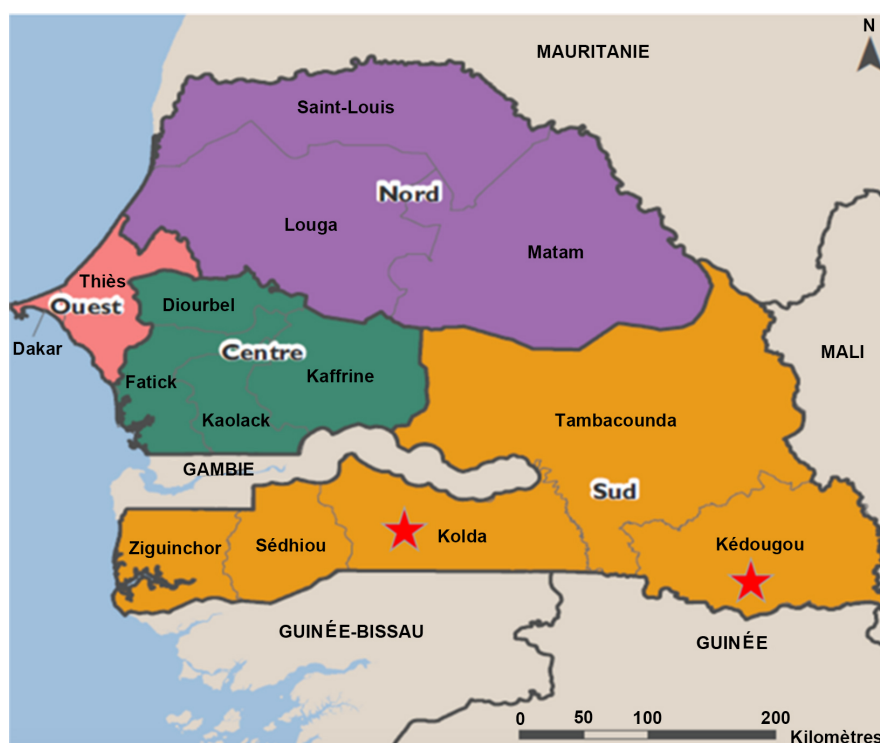
Figure 1. Map of Senegal (ANSD, 2014).