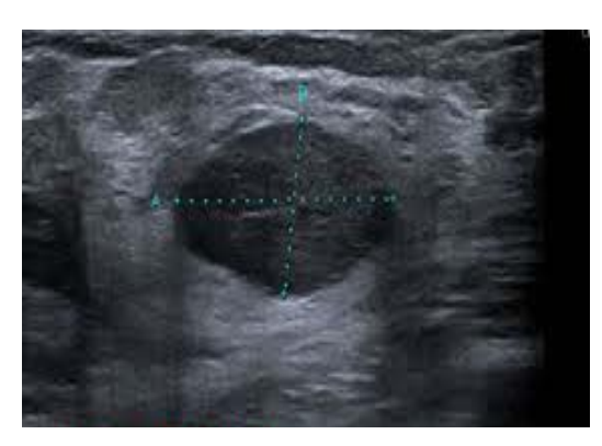
Figure 2. Ultrasound appearance of an ACR3 grade nodule. The contours are circumscribed. The major axis is parallel to the cutaneous levels.