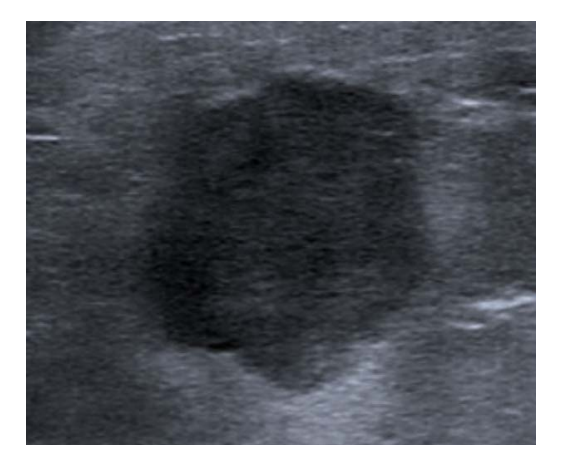
Figure 3. Ultrasound appearance of an ACR4 grade nodule. Contours are partially hidden (arrow).