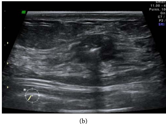
Figure 1. Ultrasound sections with biopsy needle within the nodule ((a) longitudinal view; (b) transverse view).

Data analysis was performed using the Epi Info 7.3 software.