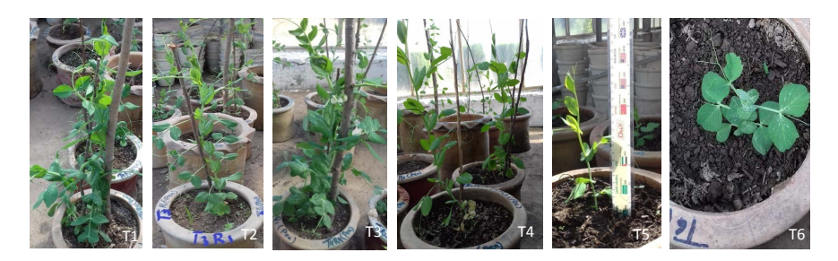
Figure 3. Growth of pea plants in various organic treatments i.e. T1 (Eggshell powder), T2 (Wood ash), T3 (Banana peel), T4 (used tea waste), T5 (Eggshell tea), T6 (Control).