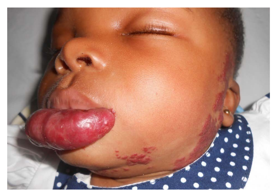
Figure 3. Infantile haemangioma located on the lip and cheek.

in aesthetic damage in 47% of cases and functional damage in 9.5% of cases.