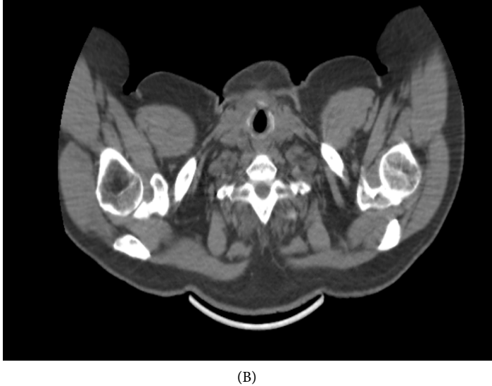
Figure 2. CT scan showing the large goiter of the patient. (A) Prior to surgery; (B) After thyroidectomy.