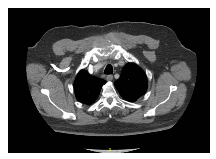
Figure 1. CT scan demonstrating the sternal lithic lesion.

In February 2016, the patient was sent to our endocrine surgery consult to evaluate a goiter growth in the last year, with compressive symptoms and thyroid hyperfunction. Physical examination noticed a giant goiter about 10 - 15 cm, in the right cervical area. Thyroid ultrasound showed an enlarged gland, mainly