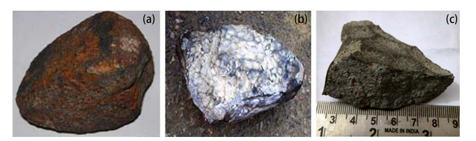
Figure 1. Photographs of some meteorites fell in North-eastern India. (a) Dergaon H5; (b) Mahadevpur H4/5; (c) Kamargaon L6.

Dergaon (26°42'N, 93°51'E) is the fourth meteorite "fall" in north-east India ( Figure 1 ). It is also an exhaustively studied meteorite of this region. A multiple fell of meteorite was observed on 2nd March, 2001, with a fireball accompanied by two land detonations. The largest fragment, weighing 10.3 kg, was recovered in the village of Balidua, ten km west of Dergaon town. Additional fragments were recovered in the village of Koilaghat of weighing about 1.5 kg and two fragments, each of weighing about 1 kg, were recovered in Majuli. The possibilities of other fragments fell in the Brahmaputra River channels cannot be ignored. The total known weight of this meteorite is 12.5 kg. This fall is classified and documented as Dergaon H5 chondrite [19]. The detail focussed on integrated petrology, bulk chemistry, oxygen isotopes, noble gas and cosmic ray track density of Dergaon reported by Shukla et al. (see [20]). A cosmic ray exposure of 9.7 Ma for Dergaon is inferred from the cosmogenic noble gas records (see [20]). Dergaon is a classic example of H chondrite with high chondrule-matrix ratio. The chondrules of Dergaon contains porphyritic olivine, porphyritic