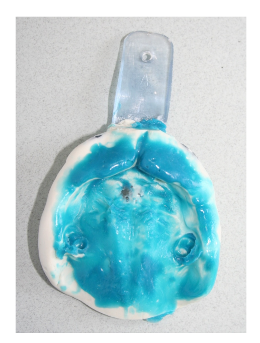
Figure 9. Primary maxilla template.