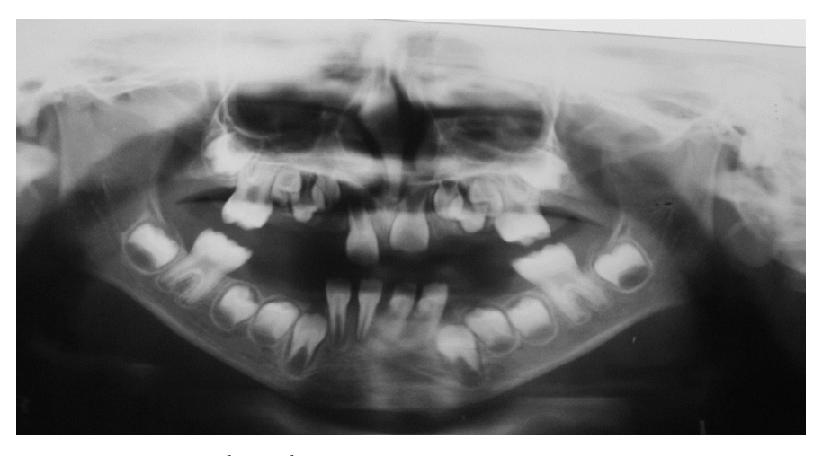
Figure 4. Panoramic radiography at age 6.