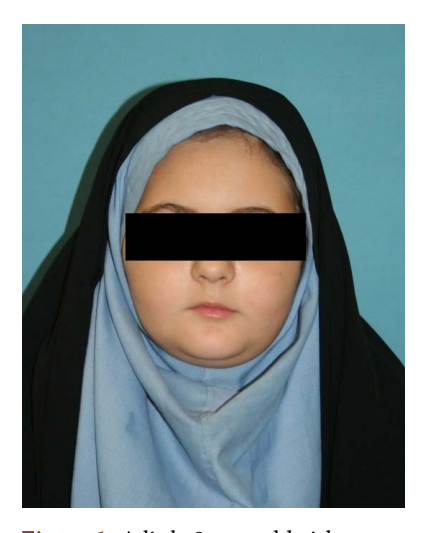
Figure 1. A little 8-year old girl.

A little 8-year old girl (Figure 1) with early complaints of looseness of permanent teeth soon after their eruption with full Edentulous referred to Dentistry department of Tehran University. Panoramic radiography of ages 4, 5, 6, 7 of the patient was available (Figures 2-5). The patient underwent follow-up process and teeth with acute periodontal problems were removed from her mouth.