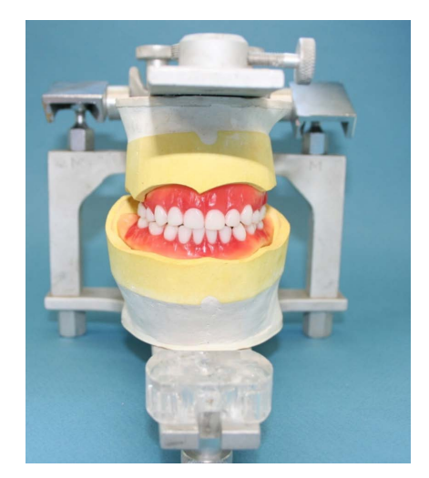
Figure 11. Arranged teeth.