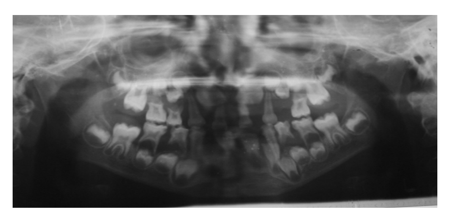
Figure 3. Panoramic radiography at age 5.