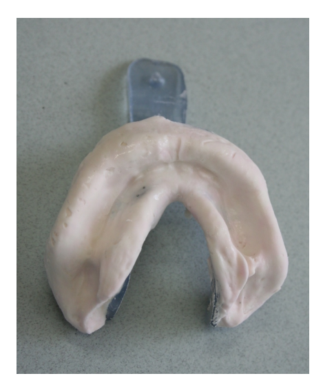
Figure 10. Primary mandibular template.