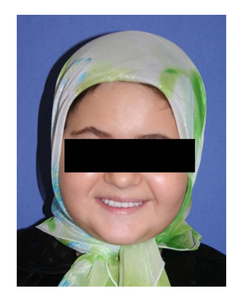
Figure 12. Installation of the teeth.