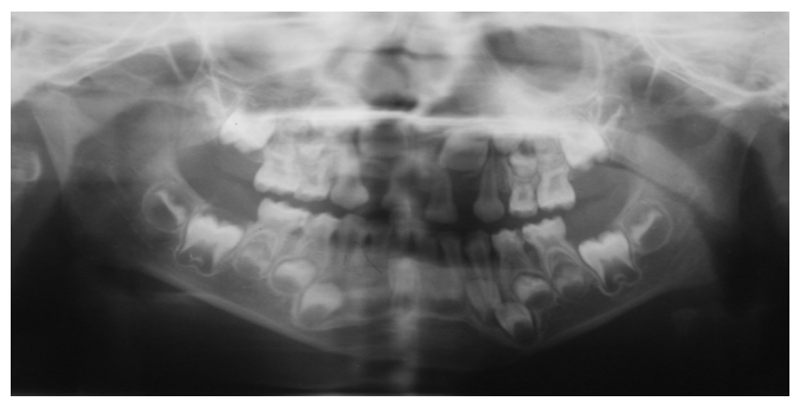
Figure 2. Panoramic radiography at age 4.