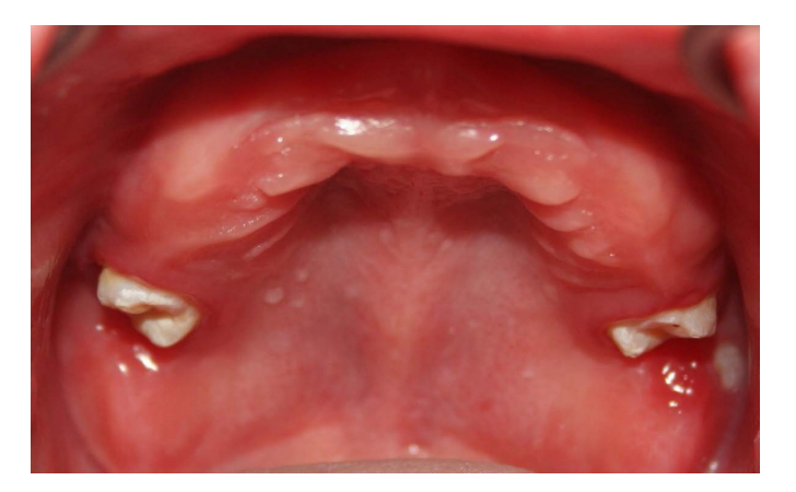
Figure 5. Maxillary occlusal view.

At the time of referring to the hospital, patient's remaining teeth included mandibular left first and second premolars and first premolar both at maxilla side (Figure 5 and Figure 6).