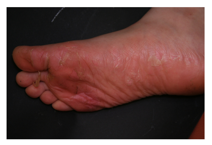
Figure 8. Hyperkeratosis of soles.