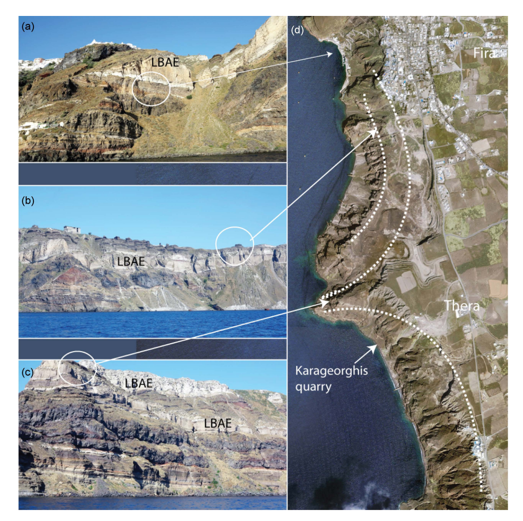
Figure 2. Satellite image, ESA ((d), right) of Thera, the main island of the Santorini volcanic group. (a) Fira Quarry; (b) North of Cape Alonaki; (c) North of Karageorghis quarry where the UPS has been radiocarbon dated by an olive tree found in situ. The lower part of the LBA eruption lies on a downfaulted terrace and contains Cycladic ceramics; (d) Two funnel-shaped collapse structures meet at Cape Alonaki where they produced concentric terraces on the caldera wall.

According to Fouqué and later scholars this pumice series ( Figure 2 ) only appears on the lowermost parts of the caldera wall on Thera, more specifically in the lower part of the caldera wall at Oia and between Fira and Cape Akrotiri. In the following, we argue that the LPS and UPS are essentially the same layer. However, a recent study claims to have found the LPS on the island of Anaphi, which lies about 30 km east of Santorini [14].