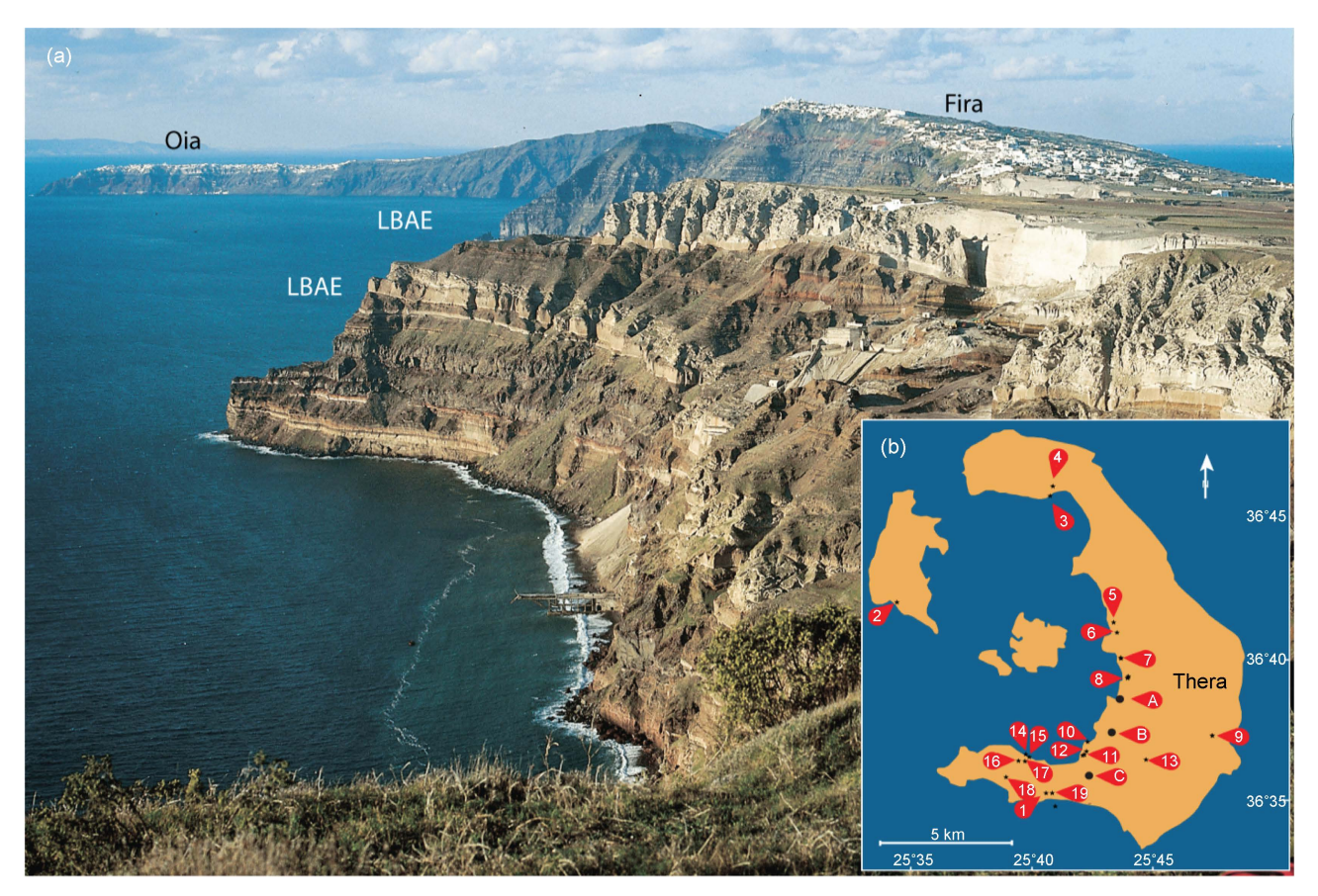
Figure 1. (a) View of Thera facing north. The two prominent pumice series were produced by the Late Bronze Age (LBA) eruption. LBAE = Late Bronze Age eruption products. They rest on concentric terraces that were formed by erosion following a caldera collapse prior to this eruption. (b) (bottom right). Location map of Santorini. The numbers refer to archaeological and geological sites. A, B, C: IGME drill sites.

Fouqué [1]. He showed that there are two prominent pumice layers on Santorini which he named ponce inferieure and ponce superieure—the Lower Pumice Series (LPS) and the Upper Pumice Series (UPS). He shows the LPS as a continuous layer that underlies other (apparently younger) volcanic rocks on Santorini. The LPS and UPS are similar in their general appearance, but seemingly had different ages. Figure 1(a) summarises the theme of our paper: Are the two pumice layers identical or not?