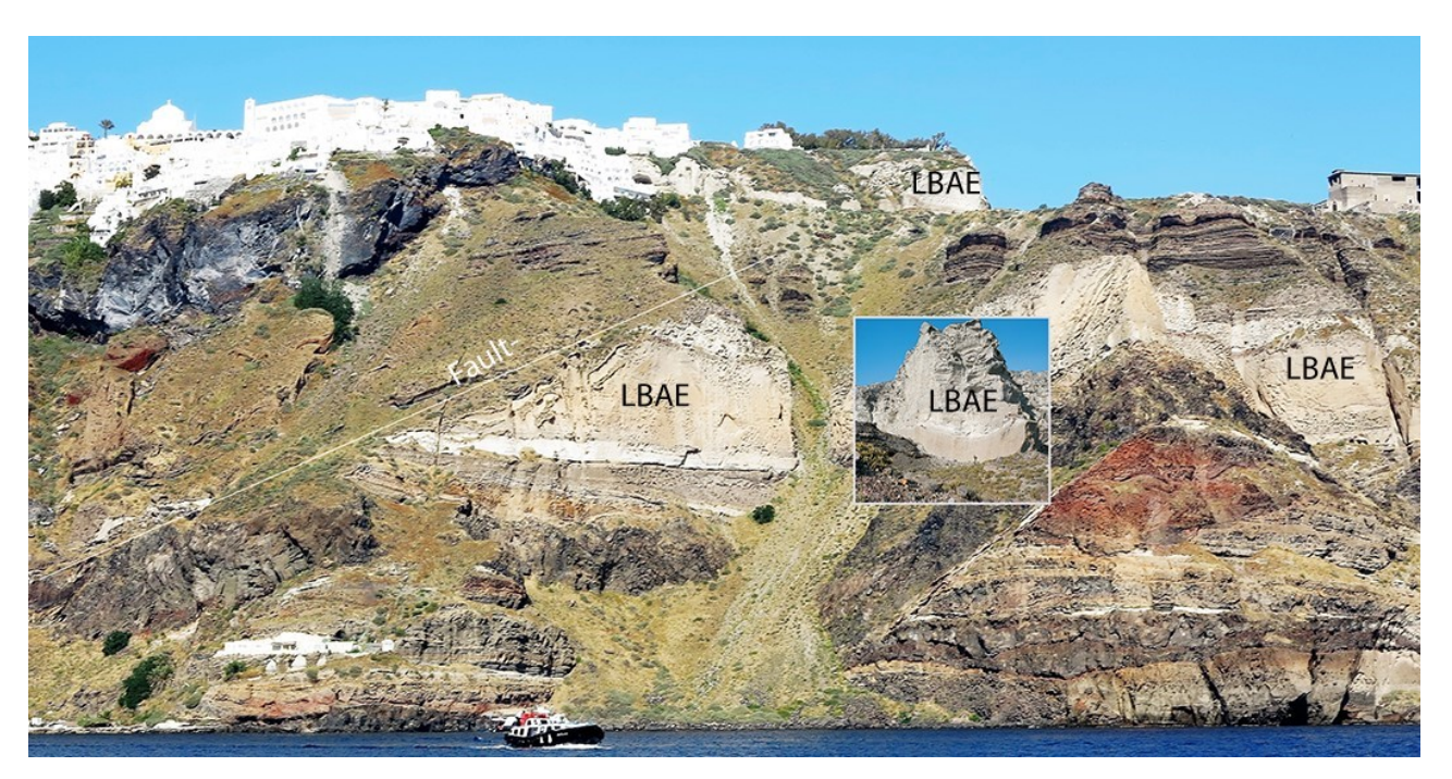
Figure 3. A visual comparison of the so-called "LPS" from the caldera wall below Fira with the LBA eruption products from the nearby Cape Alonaki (inserted photo) shows a striking similarity in the total thickness in the three exposures.

The up to 60 m thick pumice layers below Fira (Figure 3) have the same overall appearance, the same sequence and the same erosional pattern as the UPS in the