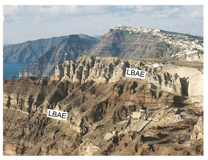
Figure 5. Two levels of exposure of the eruption products merge on top of Cape Alonaki. The lower one is slightly darker due to the overlying black lapilli of the Upper Scoria Series (USS). The LPS and UPS get closer to each other and finally merge in the Karageorghis quarry.