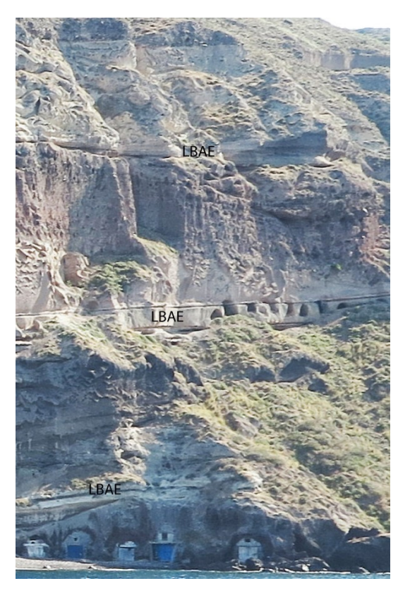
Figure 7. The pumice and ash of the LBA eruption had mantled the entire volcanic edifice including the inner side of the caldera. Erosion has removed most of it but remnants are still visible where concentric terraces existed on the wall. The caves of a former monastery above Balos harbour were dug into the pumice of the LBA eruption that is resting on a narrow concentric terrace.

been found in the Akrotiri excavation. We think that this pumice most probably came from Santorini itself, where several pumice layers are present in the caldera wall which was accessible in the Bronze Age.