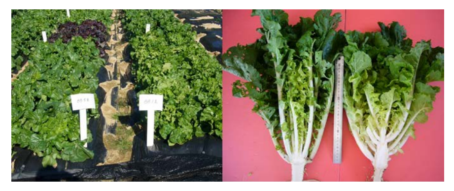
Figure 1. Morphology of BB#5 compared to BB#1. Right is BB#1 and left is BB#5 in each figure. Left: uniformity on the field in fall season. Right Length of flower stalk grown in spring season.

genesis with NMU was confirmed as a practical method of stabilizing allopolyploids between B. rapa and R. sativus . BB#5 was registered after 2 year's examination in 2015.