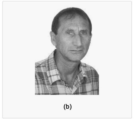
Figure 1. A screen selected from the digital questionnaires of the first experiment showing a winner and a runner-up from the sample of candidates participating in the 2012 municipal elections in Santa Catarina. It asked: "Which person is more competent?".