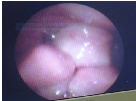
Figure 2. Distorted view of laryngeal inlet on flexible laryngoscopy.