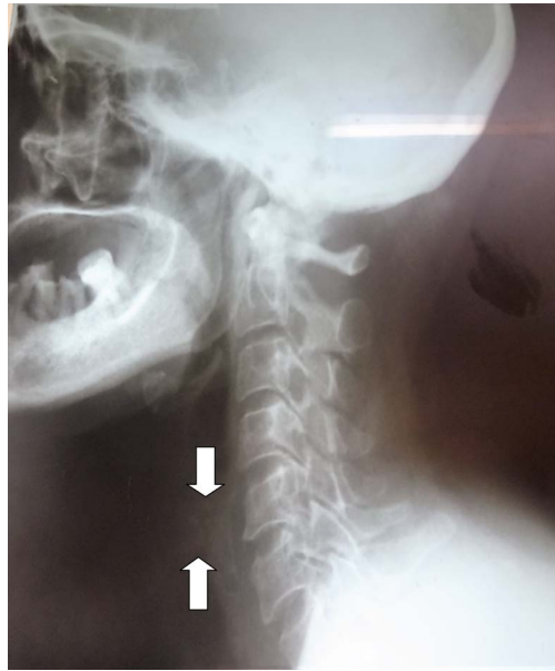
Figure 1. Lateral view of X-ray soft tissue neck showing soft tissue mass obliterating laryngotracheal air column (between the white arrows).