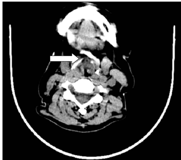
Figure 3. Displaced fracture of the thyroid cartilage (white arrow).