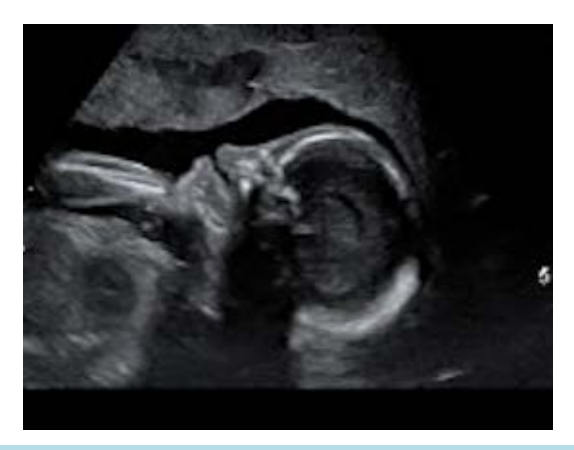
Figure 1. 23 wks, sagittal view, absence of nose, prominent upper lip.

The post mortem CT scan (Figure 4) confirmed the absence of the nasal bone and also showed cribriform plate aplasia and absence of ethmoid sinuses and cells.