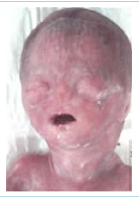
Figure 3. Confirmation of arhinia after termination.