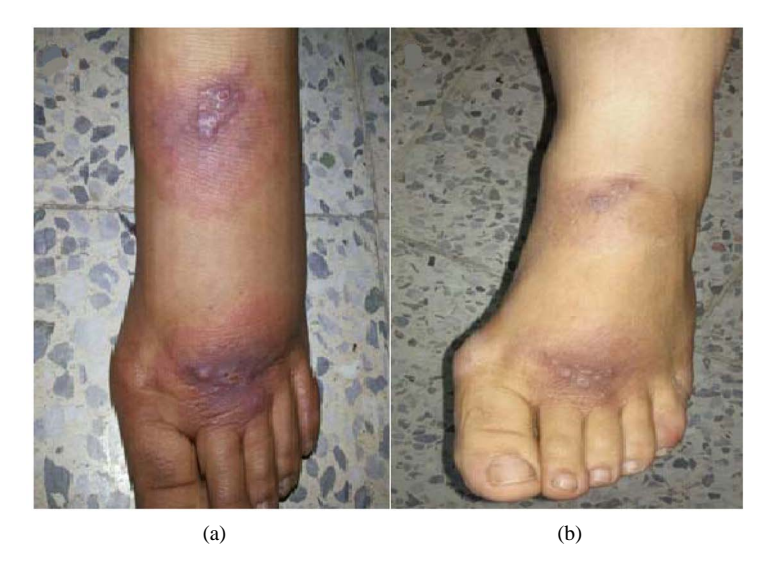
Figure 4. (a) A 30-year-old female with CL before treatment; (b) The same patient after 6 weeks of treatment with (ketoconazole and zinc sulfate).