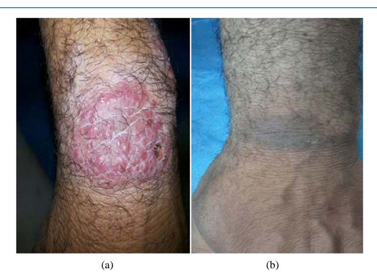
Figure 2. (a) A 45-year-old man with CL before treatment; (b) The same patient after 6 weeks of treatment with (ketoconazole and zinc sulfate).