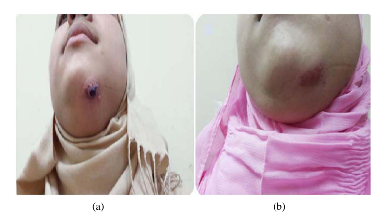
Figure 3. (a) A 17-year-old female with CL before treatment; (b) The same patient after 6 weeks of treatment with (ketoconazole and zinc sulfate).