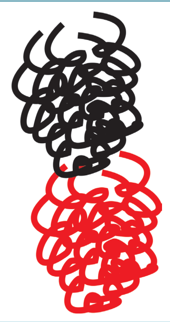
Figure 5. A microtubule dimer ( \alpha —red, \beta —black).

Once the daughter centriole size grows to approximately 80% of that of the mother centriole, they form a new mother-daughter centriole pair. This pair is a duplicate of an adjacent similarly forming centriole pair.