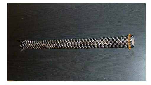
Figure 3. A microtubule.