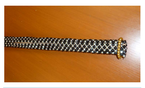
Figure 4. Microtubule spindle.

chromosome strings move toward and align themselves with the axis of the mitotic spindle. In Phase III, called "Anaphase", the chromosome strings divide and move toward opposite ends of the elongating spindle. Finally, in Phase IV, known as "Telophase", new nuclear membranes form about the separated chromosome strings, the mitotic spindle breaks apart and the cell separation begins completion with half the cytoplasm going with each new nucleus [1] [9]-[11].