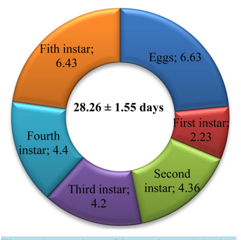
Figure 1. Durations of incubation and the immature stages of Pseudotheraptus devastans .

This duration is included in the same time interval (21 - 40 days) by the nearby species P. wayi [14]. The instars survival rates during rearing were 83.33%, 64.61%, 90.47%, 78.94%, 86.66% respectively (Figure 3). The