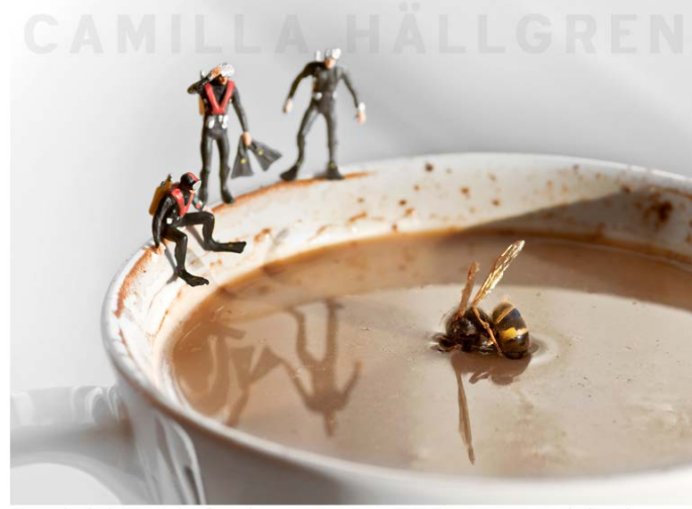
vas clearly dangerous, but for real men quitting is never an option. www.

From socially shaped norms about gender boys will understand what counts as masculine and what is seen as a high or low status masculinity; what is seen as acceptable boyhood-or not. Boys will meet crucial, social obstacles that limit their options to emotionality, operationalized in phrases such as "Big boys don't cry". Other norms will separate them from girls and degrades activities and materials marked as feminine (Kane, 2006). Boys will get involved in other, less protecting contexts than girls do. Further, boys are expected to show toughness and to deny pain, weaknesses and illness. They are expected to be successful, adventurous and competitive towards other boys. The masculinity stereotype is about aggressiveness, physical violence and being emotionally restraint. From media images, boys are informed that the ideal male body is large, strong, and muscular. Boys also learn that masculine prestige is about taking risks, driving fast, risk your life, be cool, live fast and die young: Do not be soft, and whatever you do: Do not be a girl! Be a man! Save the world! These stereotyping ideals about being a proper boy are no children's game. Making a boy identity in relation to a hegemonic masculinity and according to stereotyped ideals could come with a high price, not only for boys, but for society. As explained by Connell (2005) the consequences of these ideals is clearly dangerous, they could even be deadly.