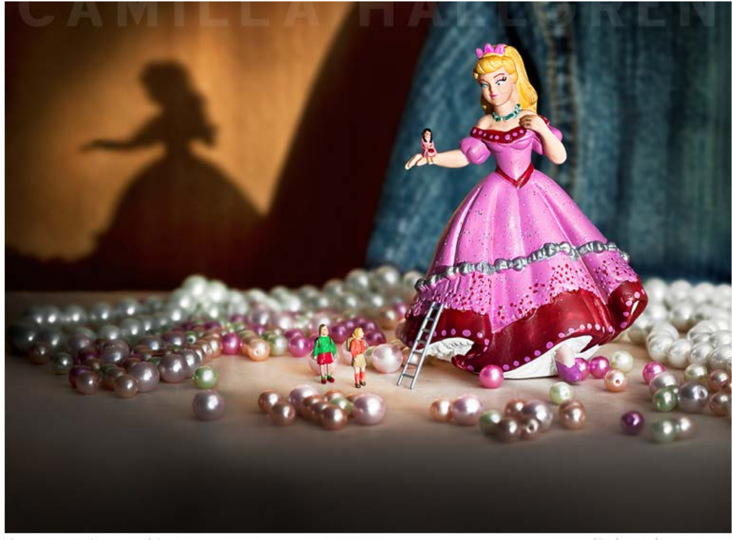
Appearance is everything

One other reasons of children's gendered differences in the experience of being in the world with Others, may be found in the interplay between the Self and the Other, and its associated struggle between being a subject or object in the gaze of others (de Beauvoir, 1949, 2011). As discussed in Hällgren (2013a) de Beauvoir explains that in the making of a feminine identity, there is no actual struggle of being a subject in the interplay between the self and others. Because of the asymmetric power relation between the two sexes, the scene is already set when the feminine self is played towards society and other people. By a socially constructed default, women are pre-defined as the object, and a subordinated correlate to a masculine subject.