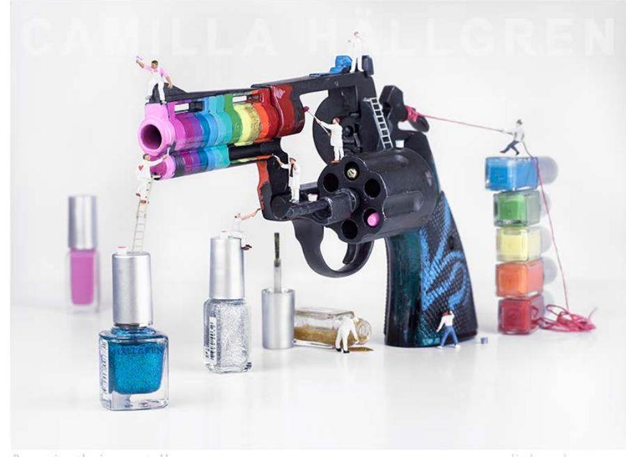
Protecting the innocent. II

The insight of that there is more to see than meets the eye, has been an important reason for exploring Art Blended Research in this article. In conclusion, the strength of this kind of research does not lie in the ability to explain what is. Instead, the strength of Art Blended Research is found in possible explorations and inspirations of what might be.