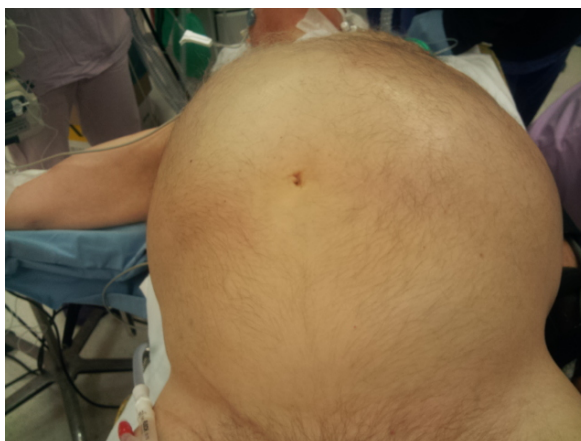
Figure 1. Patient on the operation table: clinical appearance of the huge abdominal distension.

Axial pictures confirmed an enormous colonic distension due to a SV extending from the pelvis up to the thorax nearly at the level of the tracheal bifurcation ( Figure 3 ).