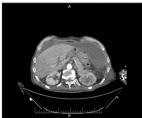
Figure 6. Late postoperative CT scan showing two large communicating purulent collections along the right and left paracolic gutter.