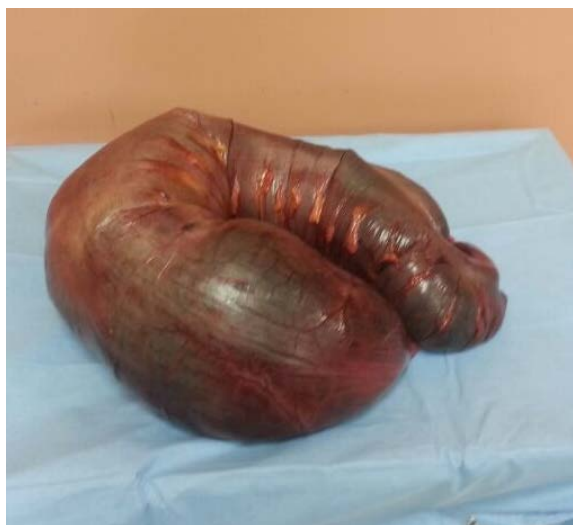
Figure 5. Operative specimen of colonic resection.

Prolonged ascitic effusion came out through the other pelvic drainage since POD 22: two days later the tube was removed when no more liquid escaped. Tracheal tube was taken in POD 16 and since then the patient was in spontaneous breathing with mask oxygen administration.