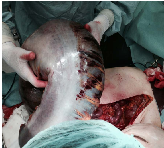
Figure 4. Intraoperative picture: sigmoid colon looks like an inner tube of a middle size car.