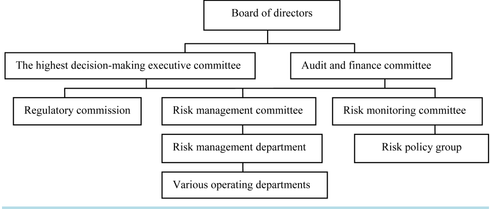
Figure 2. Organization structure design of risk control.