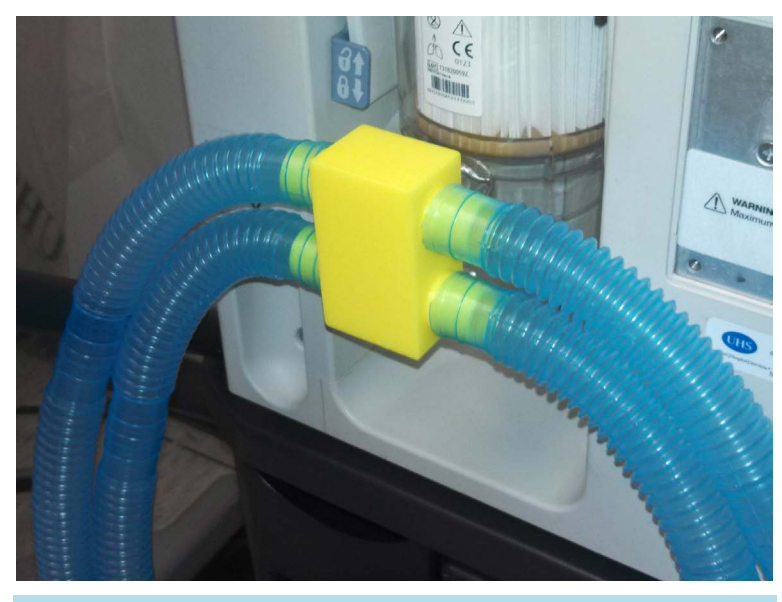
Figure 2. "Fit" Test of 4-port manifold on Ventilator.

event of a disaster surge involving patients with pulmonary damage. The digital files for the manifold can be freely shared over the internet on websites such as "Thingiverse", assuring availability in areas or services with limited healthcare resources [9]. The file can be modified in any one of dozen free CAD programs, thereby increasing the likelihood of shortened product development and increased use of derivative versions [10].