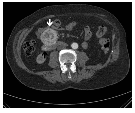
Figure 3. Patient presented with acute upper GI haemorrhage. Axial CT image showed the lesion has eroded through into the duodenum (white arrow). Active contrast extravasion indicating active haemorrhage (black arrow) was seen in the second and third part of the duodenum. The patient underwent tumour embolization for haemostasis.