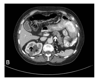
Figure 4. Partial response to sunitinib. On the selected pretreatment axial CT image, a large pancreatic metastasis (white arrow) and a contralateral metastasis in the right kidney (white arrow) were seen. Six months after commencing on sunitinib, both lesions have decreased in size.

only 2% - 4% of all pancreatic lesions with colon, lung, breast, malignant melanoma along with RCC being the most common primary tumours [10,24,25].