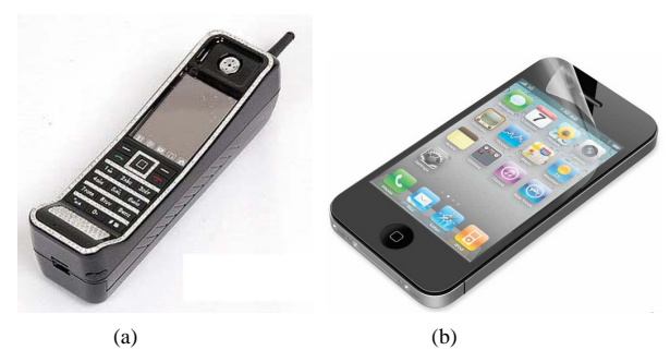
Figure 2. (a) Cellphone in early; (b) Iphone at present.