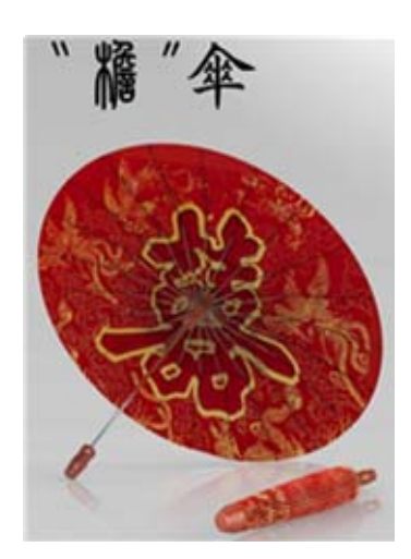
Figure 4. "Yan" Umbrella (Designer: Liu Yinjie, Luo Yunhao).