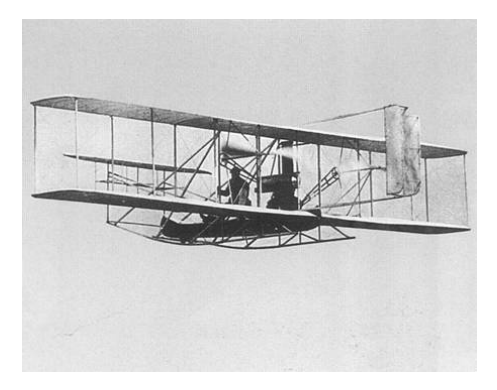
Figure 3. The first plane made by the Wright brothers.

Intelligence comes next. It is generally agreed that those who are mentally handicapped may become a great artist, but this is not true for an industrial designer. Design is to solve problems, requiring one's capability in logical judgment and needed knowledge. Just as the logical thinking mentioned above, it is one of the embodiment of design capability, requiring one's ability in induction, deduction, analysis, abstraction and synthesis. Imaginal thinking allows one person to express his own idea and display his personality, but product innovation serves for the broad masses of people, it is a creative activity for the whole society.