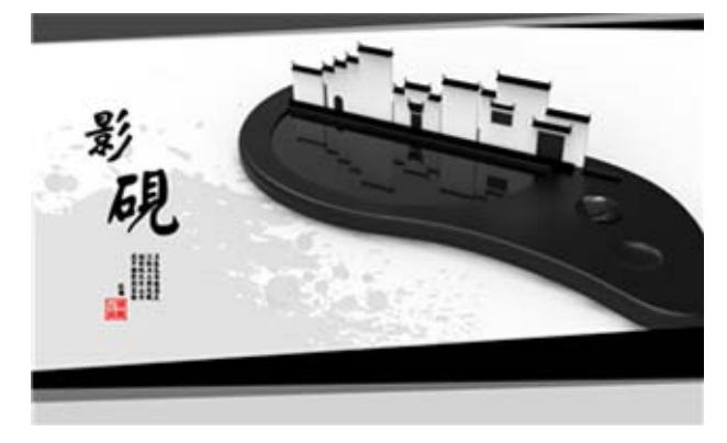
Figure 5. Ying Inkstone (Designer: Song Shuning).

When teachers introduce such courses as transportation tools or product development and design, they can invite teachers in biological science or geographic or resources science. The research field of biological science can lead the students to view the development of human being and nature in the future. The structures of living things can draw the students' attention to the innovation of product structure and function. The knowledge system of geography and resources science can also trigger students' interest in ecological design. The exploration of the interactive teaching of multi-disciplinary can not only make the teaching of speciality courses reach a perfect combination of technology and art, but also effectively develop the students' creative thinking, a kind of all-direction divergent thinking.