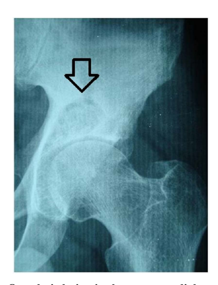
Figure 1. Osteolytic lesion in the superomedial acetabulum.

lum using anterior (Smith-Peterson) approach. Intraoperative frozen sections revealed granulomatous inflamematory focus with sequestrum. Debridement was performed and the cavity packed with autograft from the right iliac crest. The material was then sent for a routine pathological analysis and the result was chronic inflamematory fibro-lipomatous tissues (Figure 3). Subsequent immunonological tests confirmed a diagnosis of Brucella osteomyelitis- Brucella agglutination test (Rose-Bengal), Brucella IgG & IgM titers 2.599 (index < 0.593) & 0.773 (index < 0.563) respectively] and Brucella Agglutination (Coombs Antiserum) \geq 1/160 were all positive. The patient was commenced on a triple oral combination therapy of doxycycline, rifampicin and ciprofloxacin for three months. Joint movement exercises were initiated after the surgery and weight bearing was restricted for 6 weeks. The patient has made a full recovery of range of joint movement and function postoperatively with resolution of symptoms at his last follow-up visit one year postoperatively. In addition, his CRP and Brucella Agglutination (Coombs Antiserum) values have reverted back to normal.