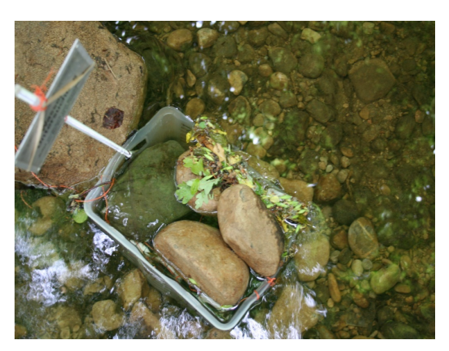
Figure 1. Experimental setup: Exposure of a basket with 5 plexiglass cages in the Hornbach at the downstream site.

Previously, fresh green alder leaves had been plucked from an alder tree in the catchment, using only intact leaves without holes due to insect feeding. The leaves had been watered in dechlorinated aerated tap water for about 4 days at room temperature with daily replacement of the water, until dissolution of the colors and maceration of the leaves. After drying at room temperature the leaves were stored in closed plastic bags until use in the experiments. Each week the cages were controlled as follows: the animals were counted, dead ones removed, the percentage leaf surface sceletized was estimated as 0, <25%, <50%, <75%, <100% and thereafter replaced by a new leaf. The experiments ran for up to 6 weeks during the main time of pesticide application in a dry period in early summer 2011.