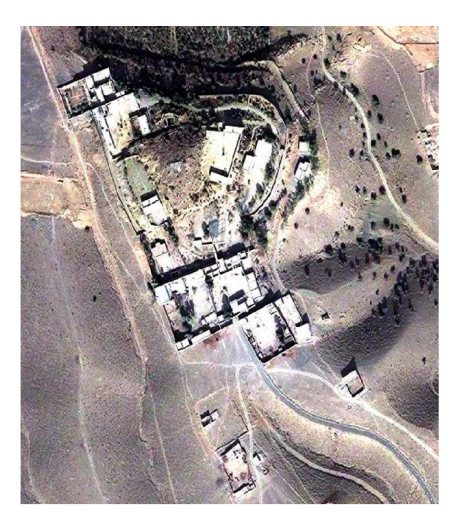
Figure 1. An example of structures in the FATA region from QuickBird 2 imagery.

A systematic search was undertaken in 1 km² grids to identify structures that showed potential damage from drone bombings. Searches began in the upper left hand corner of each grid and continued east until reaching the easternmost section of the grid or where the image was subset. A 100 m by 100 m window was used to examine the structures for potential drone damage. Potential sites were marked as regions of interest in vector files, then examined by all authors to assess if there were bombed sites. Once potential bombed sites were identified, we examined publicly available Google Earth imagery to identify if there was high-resolution imagery before and after November 2009.