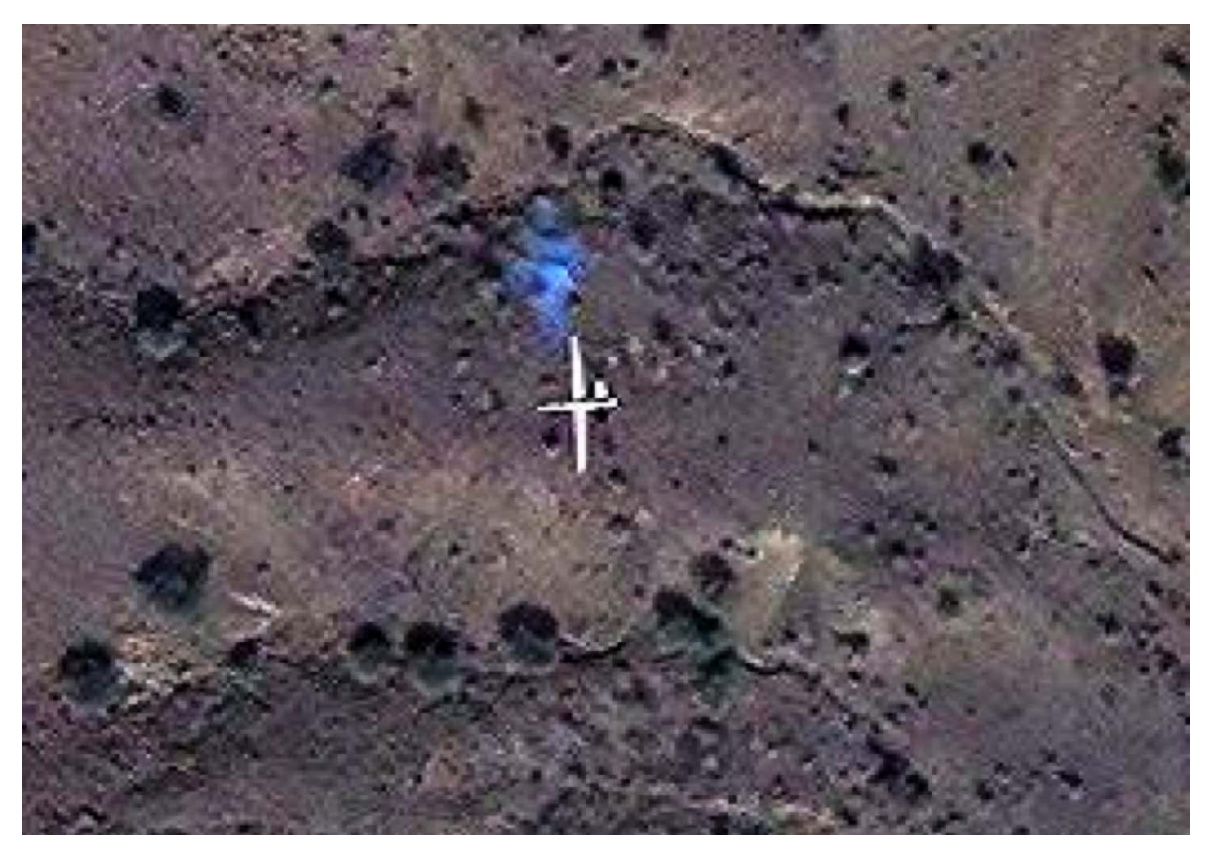
Figure 5. An MQ-1B Predator drone flying over the landscape on November 9, 2009.

quality of life variables within the FATA and cross border regions in Afghanistan. In theory, US policy in southern Afghanistan and the FATA can be assessed using remote sensing imagery over a number of spatial scales. Ethnic groups in the FATA are extremely independent, operate at a tribal level, and do not always accept government aid or intervention [8]. According to The United States Agency for International Development, there is no US humanitarian aid access to the FATA [14]. Thus, the success of the US controlled areas can be compared to the FATA areas using remote sensing. The development of infrastructure such as roads and buildings is easy to quantify with high-resolution imagery [15]. High-resolution imagery can also be used to compare changes in agricultural areas, crop type, and crop health along with assessing the transportation activity in a region by examining cars and buses [16]. Moderate-resolution imagery such as free Landsat and MODIS imagery can be used to assess large-scale patterns of agricultural productivity, hydrology, and land cover change [16,17]. Finally, nightlight imagery can be used to estimate increases and decreases in energy within the region [5].