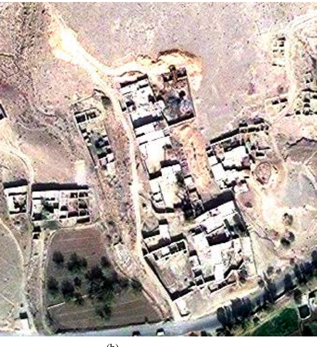
Figure 4. Potential drone bombing sites from November 2009 QuickBird 2 image.

source reporting". Sources include the New York Times, Washington Post, BBC, Reuters, Associated Press, Agence France-Press, Dawn, the Daily Times, GEO TV, and secondary source reporting from the Long War Journal and the Jamestown Foundation, among others [3]. Most of the drone bombings were in large cities such as Miram Shah and Ladha that are easy to find on maps and Google Earth. However, we were not able to find the names of smaller towns or rural areas in current GIS databases or Google Earth. Most of these areas were small villages, and news sources were unable to provide an adequate description of the locations. Currently, there are a number of groups besides the Center for American Progress that also provide interactive maps on the locations of drone bombings and militant attacks [10,11]. Standard population centers and village names are still needed for the region in order to adequately assess the accuracy and extent of drone bombings in FATA from all these sources. However, we were able to narrow the location of most of the drone bombings to the capital city of Miram Shah in the FATA.