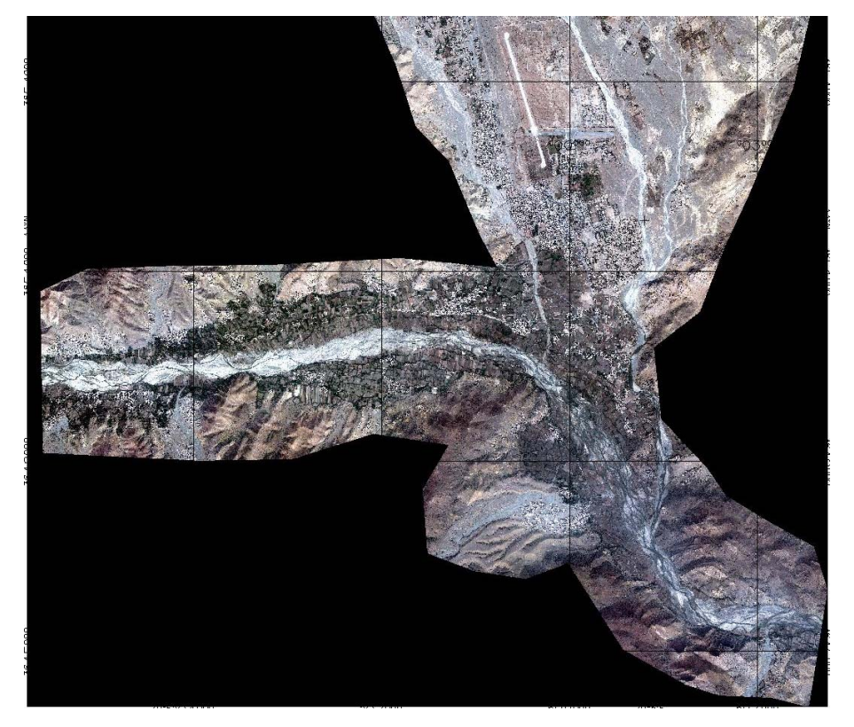
Figure 3. QuickBird 2 imagery with 1 km grid lines of Miram Shah, North Waziristan.