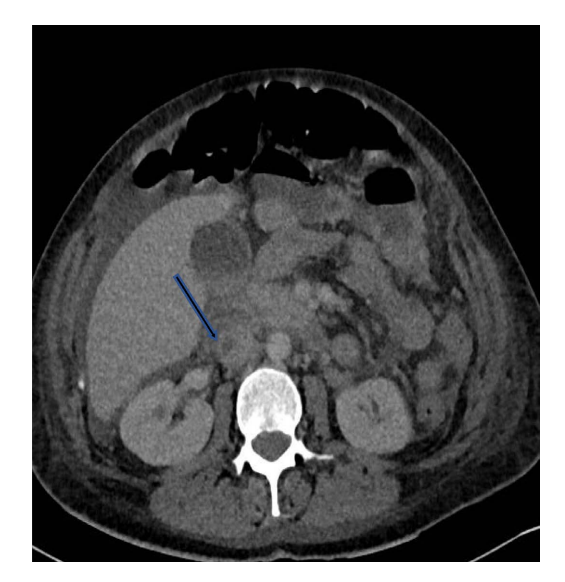
Figure 2. Axial view, the arrow shows the thrombus in the inferior vena cava.