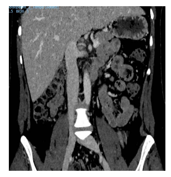
Figure 4. Coronal view, disappearance of the thrombus in the inferior vena cava.

varies from 0.05% to 0.18% of vaginal deliveries, or 1/2000 to 1/600 births. This incidence would be higher after a delivery by cesarean section. An incidence ranging from 0.42% to 2% after cesarean section has been reported in literature [3] [7]. This is a serious pathology with a mortality with lethality close to 5% even when diagnosed early [3] [6]. It occurs in patients between 30 and 40 years of age, most often in multiparous women [5] [7] as in our case reported.