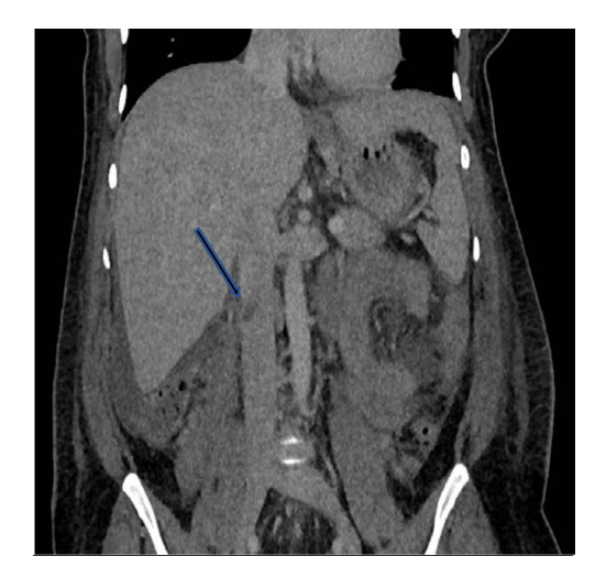
Figure 1. The arrow shows the thrombus in the inferior vena cava.