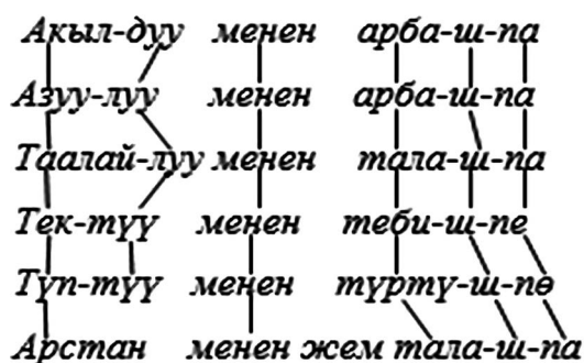
Figure 1. Properties of visualized imperatives.

The imperatives of group B possess the same paradigmatic-syntagmatic properties. However, each of them includes pairwise connected simple sayings. Their structure can also be represented schematically (Figure 2).