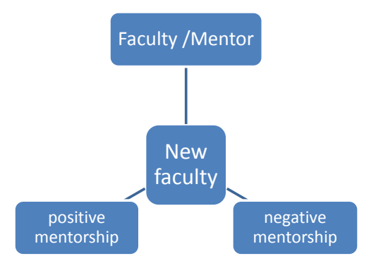
Figure 1. Mentoring attitudes and retention. Faculty to faculty relationship

Health care educators, faculty members, and clinical instructors need to remember how it was for them when they first entered the realm of academia because experiences shape every professional to a certain degree [15]. Below Figure 1 and Figure 2 are visuals of the concepts that influence the factors that indicate whether a student or new faulty remember will have a negative or positive experience with mentoring (Figure 2). Note, the conceptual visual listed begins with the instructor, and the seasoned faculty member that influences either negative or positive outcomes. Many educators work through multiple trials and strategies to present information before they become proficient in the craft of education or academia [15]. Just as in healthcare, there is a novice nurse, an advanced