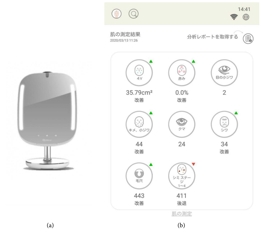
Figure 3. HiMirror-Professional. (a) HiMirror-Professional. HiMirror Professional uses the photos of patients, analyzes the skin, and saves the data. It can acquire daily skin data, and care for especially necessary sites; (b) Diagnosis. Seven items are measured; stains, pores, wrinkles, fine lines, roughness, redness, and dark circles.

The age of patients, number and content of the procedures are listed in Table 1 . The patients spent their daily life in the usual way without diet or sleep restrictions. Patients were extracted from the patients visiting the clinic. Since the biocell