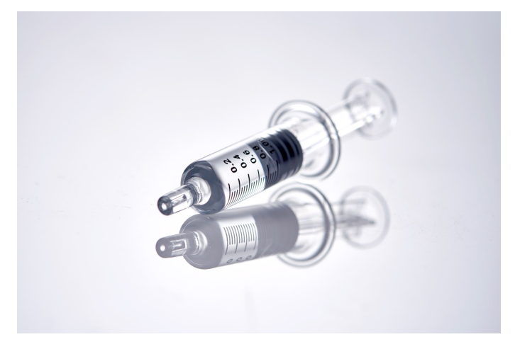
Figure 1. Biocell Shot 65. The concentration of umblilical cord blood-derived stem cell culture supernatant is 65% in this solution. 1 mL is applied to the full face.

BeBe pinocchio DM-5 SUPER DX Plus (Pure Code Inc.) is an electroporation device used on the skin ( Figure 2 ). As a principle of electroporation, a sigmoidal pulse of less than 60 V leads to electrical breakdown in the keratinized layer of the skin. Immediately after the treatment, pores are observed 0.2 mm in diameter, and 0.03 mm in diameter after 5 minutes. After 10 minutes, pores close back to the original state. A high voltage of 25,000 V per cm<sup>2</sup> causes electrical breakdown and these phenomena. Also, pores in cell membranes open, so various substances can infiltrate into the skin cells [16]. Harue Suzuki et al. proved that hyaluronic acid of molecular weight 1,000,000 penetrates the skin with this device, therefore, the ingredients of stem cell supernatant can be introduced into skin cells with the device [17].