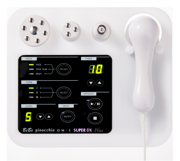
Figure 2. BeBe pinocchio DM-5 SUPER DX Plus. The device has a Cytoplasm Pass System, which introduces macromolecules and unionized neutral molecules into the dermal skin without a needle. The three types of sockets are used for body, face, and spot.

Figure 1. Biocell Shot 65. The concentration of umblilical cord blood-derived stem cell culture supernatant is 65% in this solution. 1 mL is applied to the full face.