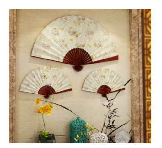
Figure 5. Effect of folding fan.