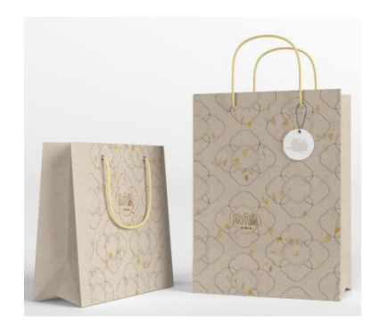
Figure 6. Bag design.

The design of brand hangtag and brooch of gumuge mangtuan paper mainly adopts local logo and central layout to attract consumers' attention. The auxiliary color system is the natural color of petals, with low saturation and clean simplicity (Zhu, 2003). This kind of color is antique, in line with the charm of the ancient tradition of "gumuge" mangtuan paper. With the development and progress of society, craftsmen are constantly innovating and can It better meets the public taste, pays attention to practicality, and combines tradition with modernity (Figure 9).