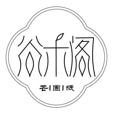
Figure 1. Log design.

The design of auxiliary graphics helps to extend the follow-up related design, and is an indispensable part of the visual identity system (Mo, 2015). It can increase the application of other elements in the VI design in the actual use process, especially in the media, it can enrich the overall content and strengthen the corporate image. The auxiliary graphics use the logo frame for repeated deformation, and use the tiled way as the background decoration. It is applied to packaging, handbags, fans and other peripheral products, which improves the visual aesthetic feeling, has strong applicability and flexibility, and thus produces visual guidance effect, with affinity (Figure 3).