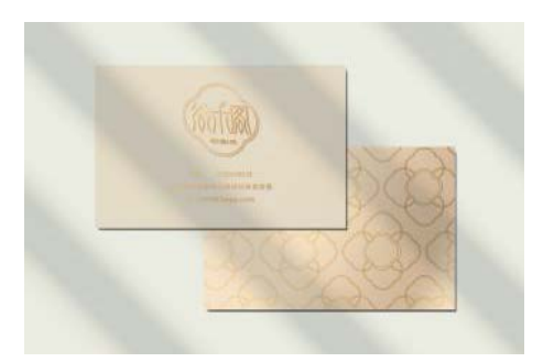
Figure 4. Business card.

Packaging design, business card and folding fan become a series of products, and the logo is highlighted with gilding style. The packaging is divided into two types: bag and box. Due to the unique shape of awn paper, the packaging is divided into different sizes, the color is natural color, the green design is followed, and the environmental protection packaging (Figure 6 and Figure 7).