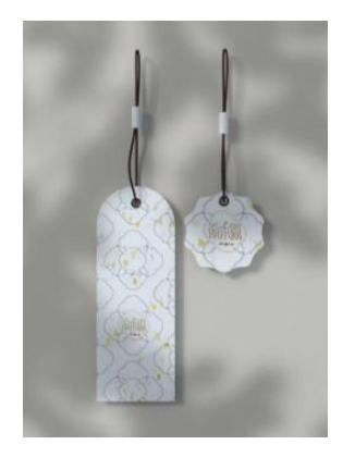
Figure 8. Tag design.