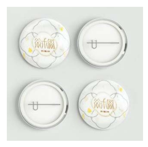
Figure 9. Brooch design.