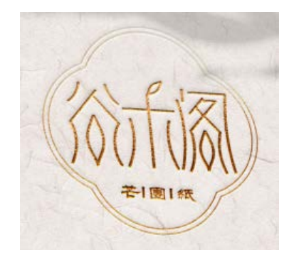
Figure 2. Logo application effect.