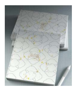
Figure 7. Notepad design.