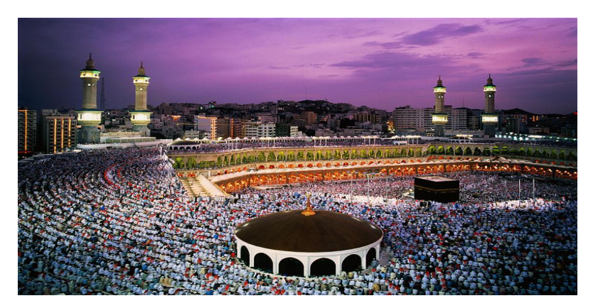
Figure 3. The 99 acre great mosque of mecca.