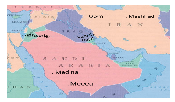
Figure 1. Muslim holy sites.

A new dawn of tourism is rising in the Middle East. The new dawn capitalizes on the region's religious assets and introduces new tourism products which are certainly changing the landscape and bring new tourists to the region.