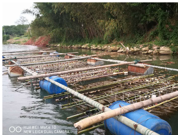
Figure 1. Photograph of artificial fish nest, taken on 10 March 2019.