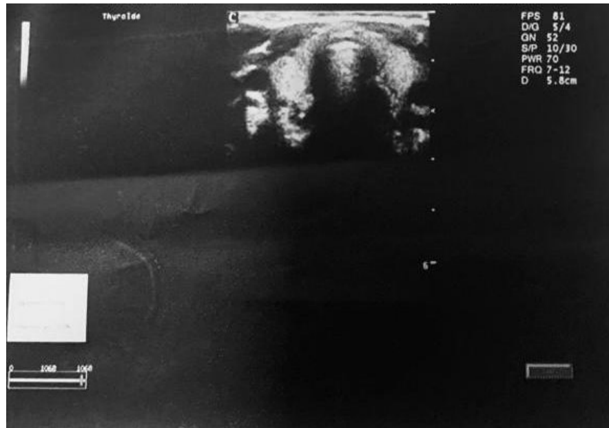
Figure 1. Thyroid ultrasound.