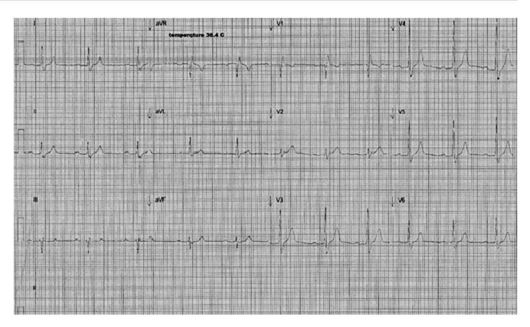
Figure 2. Incomplete right branch block with regression of the ST segment elevation at 36°4C.