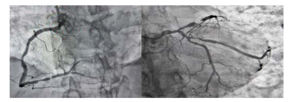
Figure 1. Three vessel lesions.

Left main coronary artery lesion was noted for 22 patients. Radial approach was used in 98%. Complications occurred in 4.5% of cases, and were mainly represented by punctur site hematoma. Coronary angioplasty was performed in 63.42% of cases, and coronary artery bypass grafting for 0.80%.