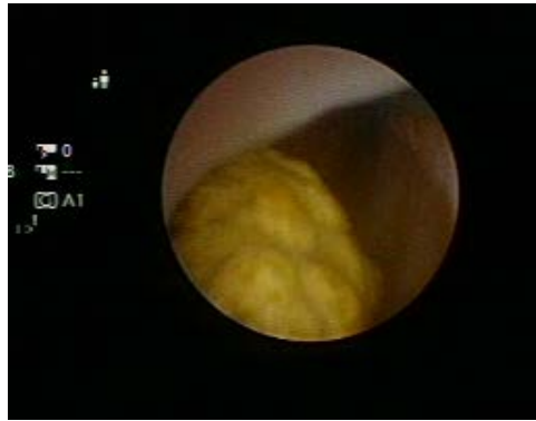
Figure 2. Intact stone visualised in the ureter before start of fragmentation.