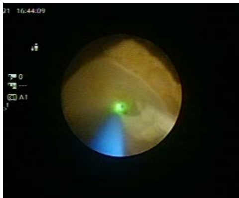
Figure 3. The stone broken with laser and the inner hollow shell exposed.