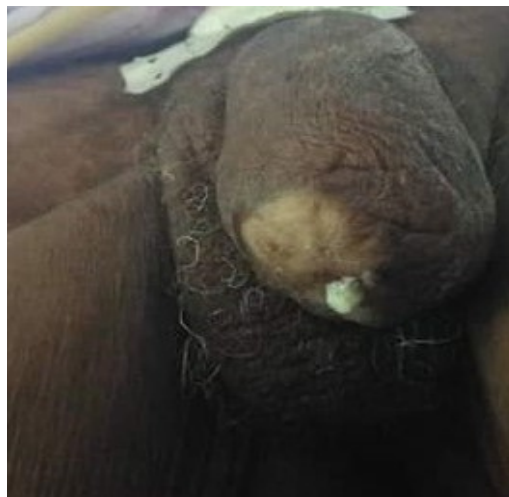
Figure 1. Stenosis of the meatus.

We reviewed the patient 6 months after meatoplasty with normal urine flow. Urine analysis and culture results were normal.