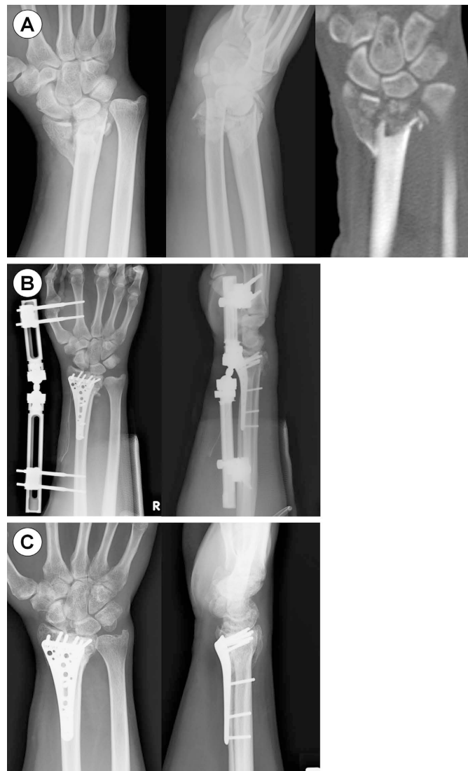
Figure 2. (A) A 31-year-old male fell from height and preoperative X-ray and CT showed AO type C3 distal radius fracture. (B) He was treated with the use of a transarticular dynamic-type external fixator combined with a volar locking plate. Note that the distal ball joint of the fixator is aligned with the lunate-capitate line. (C) At 6 months postoperatively, the collapse and redisplacement of the fracture were prevented.

The injury resulted from a lower-energy mechanism in seven female patients (mean age, 70 years) with osteoporotic bone. The injury resulted from a high-energy mechanism in four male patients (mean age, 45 years) and two patients had other fractures, including bilateral elbow fracture dislocation in one patient, lumbar fracture in the other patient, rib fractures in two patients. All fractures were completely healed without any major complications ( Figure 2 ). After a mean