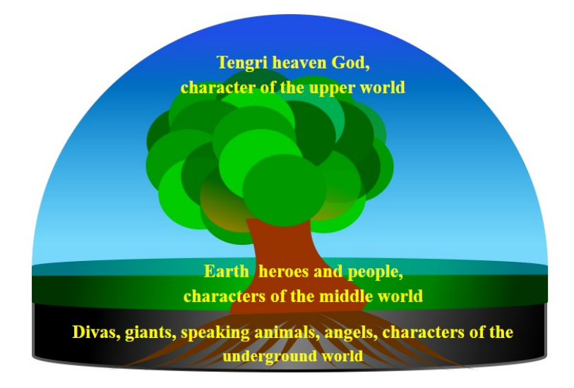
Figure 1. The ancient concept of a three-stage world in Kyrgyz folklore (epic "Er Tosh-tuk").

"Black stump" was identified with the world tree or world pole being a "substitute" to the mediation element symbolizing the "axis of the world". It adds to