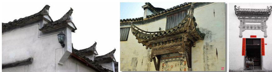
Figure 2. Small department head decoration.