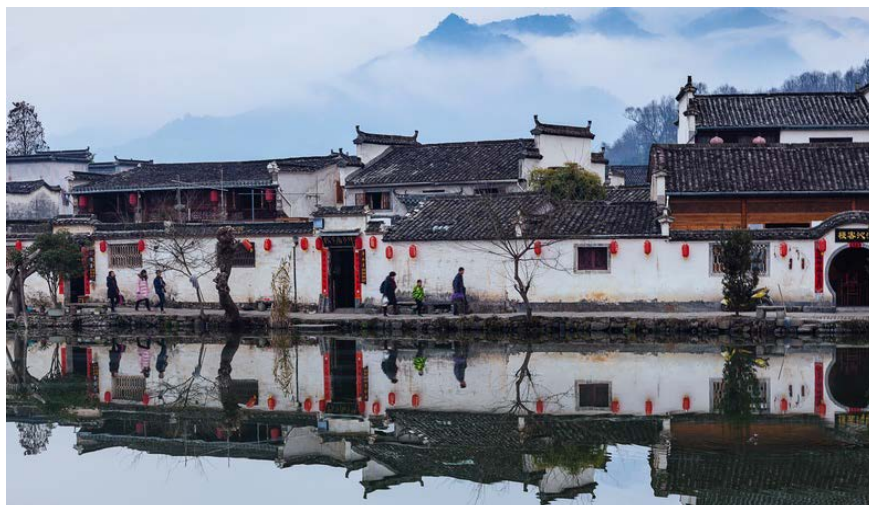
Figure 1. The whole view of Huizhou dwellings.