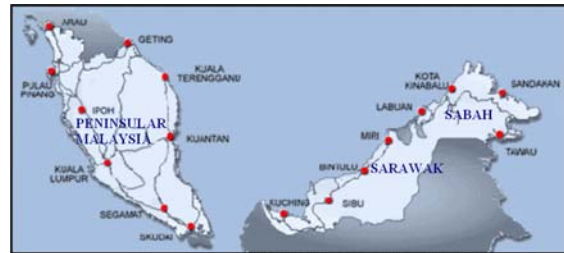
Fig. 1 Location of MASS stations in Peninsular Malaysia and Sabah and Sarawak.

The network of the MASS stations is remotely operated and managed from the Geodetic Data Processing Centre, Geodesy Section, DSMM, Kuala Lumpur. Each MASS station records in TRIMBLE proprietary formats and converts to RINEX with the Coarse Acquisition (C/A) code, P/Y code, L1/L2 carrier phases observable. The data format for all MASS stations is supplied in one-hour blocks with either in RINEX format or DAT format files.