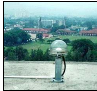
Fig. 2 Example of one of the MASS station established at JUPEM's building in Kuala Lumpur.