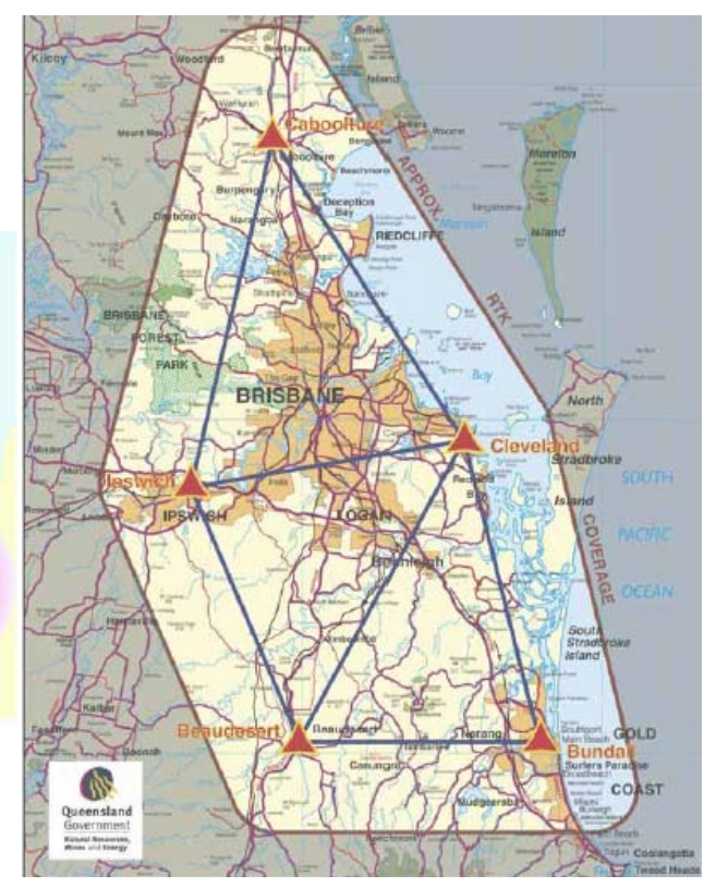
Figure 3 Proposed coverage map for the SunPOZ network in SE Queensland

Since the mid-1990s much research has been invested in developing reference network techniques to map regional atmospheric conditions (and other unmodelled double-differenced biases). These network-based techniques effectively extend the baseline length to support mediumrange RTK surveying, even up to 70km or more in mid-latitude areas (Rizos & Han, 2003). The distribution of GPSnet reference stations provides a suitable infrastructure to investigate network-based RTK over a significant regional extent.