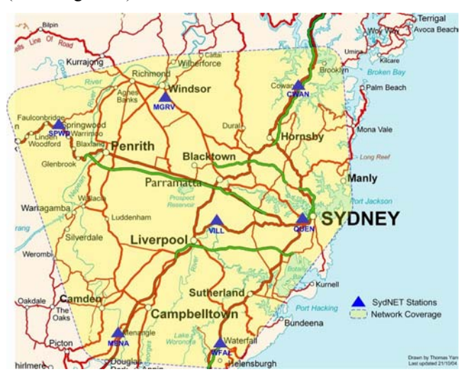
Figure 4 Current SydNet configuration

and will service the eastern seaboard from Wollongong to Newcastle (Rizos et al, 2003). Like the SunPOZ VRS network, SvdNet will be a CORS network designed from the very beginning to support real-time operations, in contrast to GPSnet, which, due to its initial development from 1994, is evolving toward real-time operations. However, the high density of SydNet stations is only intended to support research into new network-based GPS positioning techniques. This is possible because of the ability to "thin" the CORS network, and to use some SydNet stations as simulated user receivers for check purposes. Hence, although SydNet is an ideal test network for the proposed research, it is not a blueprint for a statewide CORS network. The extension of the GPS network across the state of New South Wales would be based on receiver spacings similar to those of Victoria's GPSnet (or even greater).